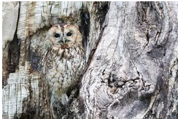
The predatory Elite are difficult to see.

The other instance of a popular vote leading to a potential disaster is Brexit. The proposed withdrawal of the United Kingdom from the European Union has looked like a set-up from the time it was first proposed. Prime Minister Cameron was under no pressure to do so when, in the lead-up to the General Election in 2015, he promised a referendum on EU membership. No serious politician would have made a commitment of this kind unless it had been approved by major players behind the scenes. What is more, if he had acted presumptuously, his advisers would have done everything they could after the election to defer the referendum indefinitely or to find some plausible reason to renege on the promise. Furthermore, it is inconceivable that British industry would have agreed to a referendum without a thorough analysis of the trade implications of a departure (which shows that the decision to go ahead with Brexit was taken at the highest level). Whitehall, too, would never have tolerated such a measure without at least a minimum period of consultation with the sectors most affected and publication of a White Paper (as a basis for debating a major policy decision).