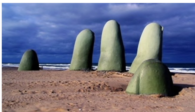
The hidden hand is much bigger than we think.

Why is this? The answer is debt, staggering levels of debt, across all developed economies. It is not just debt levels at federal and state level, but corporate debt, municipal debt, and household debt. The crash of 2008 should have seen a major correction in debt imbalances, with all the pain that goes with such a correction. The worldwide recession would have lasted ten years or more and resulted in immense suffering for many. But it was not allowed to play out naturally. Instead the international bankers decided to forestall the inevitable collapse in output by greatly increasing the money supply. They did not do this in the US only, but right across the world economy. The Federal Reserve added trillions of dollars to the national debt (It was about $8 trillion then. It is now around $22 trillion.) Further trillions were added in Euro, Yen, Yuan and Sterling. The entire world economy over the past ten years has been kept afloat artificially by ‘quantitative easing’ on a scale that no 19 th century economist had ever imagined.