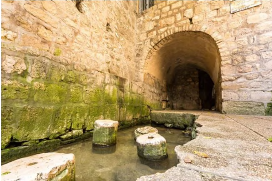
The Pool of Siloam in Jerusalem today.

The Gospel of John speaks of the miraculous healing of a blind man at the pool of Siloam. Since he had been blind from birth, the healing repaired both his brain and his eyes. The brain of a newborn babe takes several months to develop to the point where he can focus his eyes and perceive color. The man himself could appreciate just how astounding his healing had been: “Since the world began was it not heard that any man opened the eyes of one born blind.” (John 9:32)