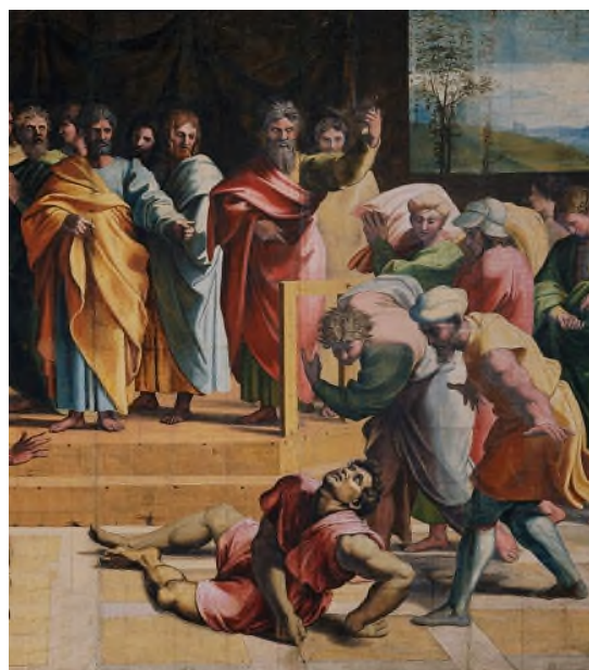
The Death of Ananias by Raphael [detail]