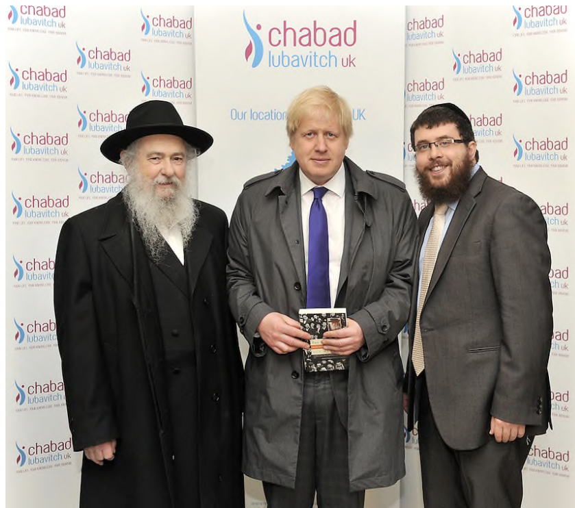
British Prime Minister, Boris Johnson, with representatives of Chabad Lubavitch, an occult Jewish group dedicated to creating a new world order. Johnson holds a copy of 'The Rebbe's Army', a very flattering account of the life and teachings of its former leader, Rebbe Menachem Mendel Schneerson (1902-94).