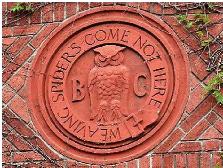
The plaque over the main entrance at Bohemian Grove in Sonoma county, California. It reads: “Weaving Spiders Come Not Here”, a line from Shakespeare’s, A Midsummer Night’s Dream . These words are read aloud before the entire group at the opening ceremony, a death ritual based on Egyptian magick.

This is the kind of item one might wear at a costume party, but not while reading before the nation a ruling of critical importance to their security. The spider is an occult symbol for the nefarious scheming that takes place behind the scenes in human affairs, beyond the ken of common man. It symbolises more than anything else the ‘work’ of the Illuminati. This is why it features prominently on a wall plaque in Bohemian Grove, where many of the Elite meet annually to indulge their lusts in the company of Illuminati brothers. The “weaving spiders” – the work of the Illuminati – can be forgotten for a few days as they soak in debauchery and celebrate their hold over mankind.