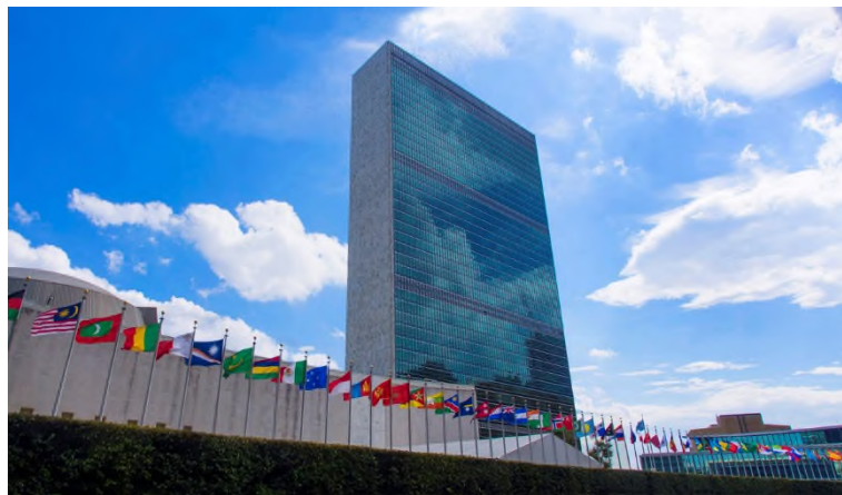
The United Nations building in New York

When an entire nation believes the same set of lies, its behavior becomes predictable. The Illuminati have been working hard over the past 70 years to get all nations to subscribe to the same set of lies. The United Nations is the great pantheon of liars, where men of renown convene to devise new lies to beguile mankind and lead the masses forward into a One World government.