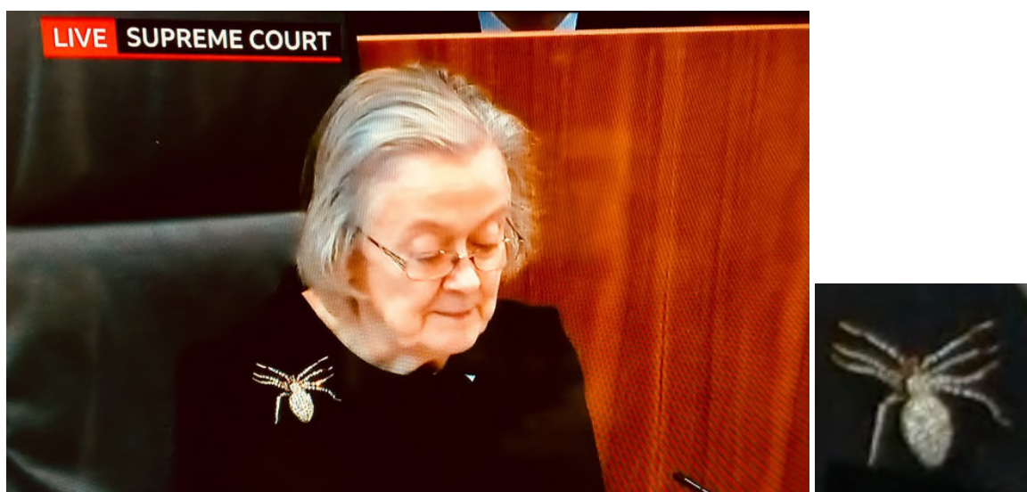
Lady Hale and her decorative spider, as seen on television.

The Illuminati even had the gall to mock the British public for their naivete when the inevitable supreme court ruling to recall Parliament was handed down. Lady Hale, the presiding judge, appeared before the cameras wearing an audacious ornament on her breast, a giant spider!