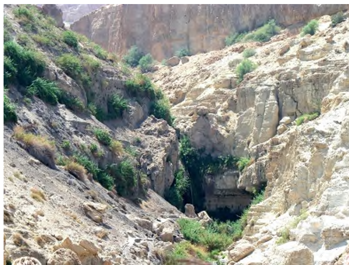
One of the caves at Adullam, Israel, where David's men dwelt before transferring to Ziklag.

Christians are also reluctant to believe that thieves of this calibre could exist in their midst. After all, such people, they believe, would hardly be able to hide their greed and their duplicity. But the Bible tells us that this isn't necessarily so. When David and his men returned to find Ziklag in flames, they were in shock. Their wives and little ones had been kidnapped by a marauding band of Amalekites. Their grief was so intense that they even spoke of stoning David for what seemed to them a grave lapse of leadership. Keeping his head in a crisis and trusting in God, David set off with all 600 of his men to track down the Amalekites. En route some 200 of them were so overcome with exhaustion that they couldn't continue. The remaining 400 pressed on and, after a lengthy engagement with the enemy, managed to recover their wives and children unharmed. They also secured a huge amount of booty, the wealth accumulated by the Amalekites during their sordid escapades.