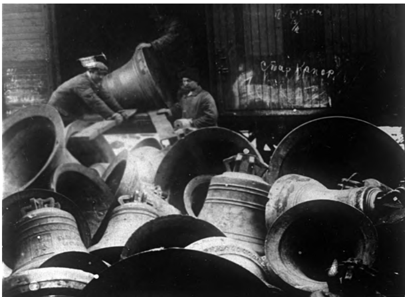
Bells taken from Russian churches after the 1917 revolution.

These believers protect their feet daily with the “preparation of the gospel of peace” (Ephesian 6:15) . The “preparation” in question is their conscious immersion each morning in the wonderful truth of the Gospel and the irrevocable promises of God. With such protection, like the shoes of badgers' skin mentioned by God in the book of Ezekiel, their walk with Christ is sweet indeed.