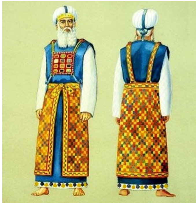
Garments worn by the High Priest. Note the row of alternating bells and pomegranates sewn onto the hem of his ephod.