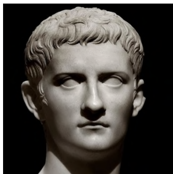
Germanicus, father of the Emperor Caligula.

They faithfully wear the caligae , the hobnailed sandals that Paul refers to. Their merit lies in the part we cannot see, the studded sole. These grip tenaciously in slippery conditions and enable the wearer to maintain his poise and mobility in any terrain.