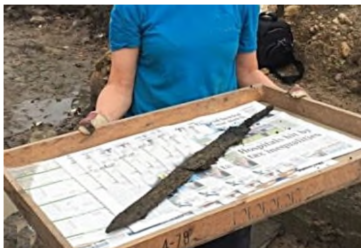
Ancient Roman sword found in Scotland in 2017. It dates from around 120 A.D.

This brings us to “...the sword of the Spirit, which is the word of God:” (Ephesians 6:17). The Greek word for ‘sword’ that Paul used was machaira , which corresponds to the short gladius carried by a Roman soldier. It was designed for hand-to-hand combat in a confined space where only a thrusting motion was possible.