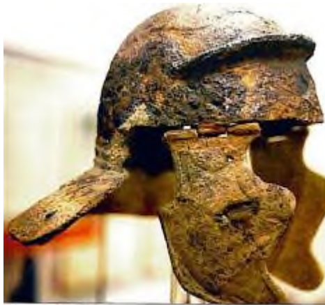
Ancient Roman military helmet.

The armor of God offers two layers of protection, not one. The galea or helmet is shielding our head even while our shield is engaged elsewhere.