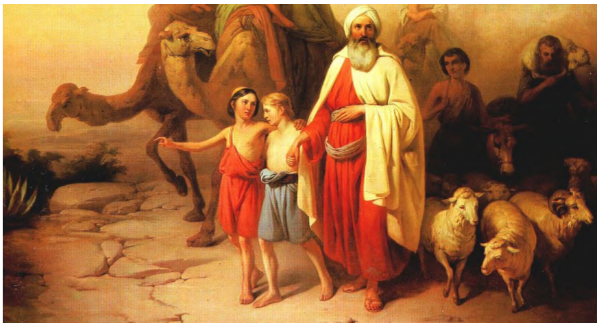
Abraham with Ishmael and Isaac.

Does the English language have nine words that are more beautiful? While we are here on earth, He is our shield. And when we arrive in heaven, He is our exceeding great reward. We will have no difficulty wielding the shield of faith if we walk with this truth pulsating in our veins.