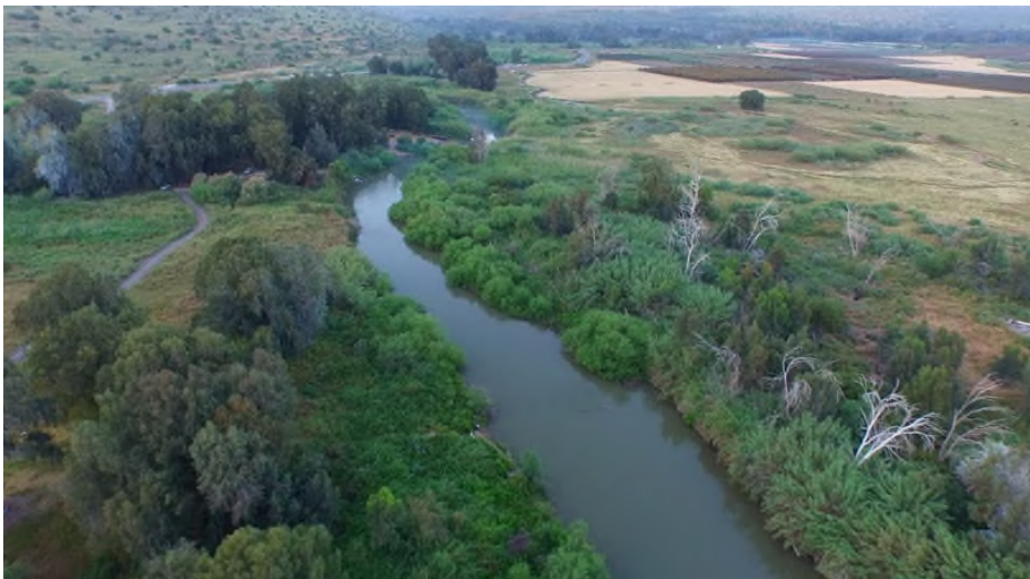
The river Jordan today.

The rulers of the darkness of this world have set in place a system that keeps mankind in bondage. This system – the Satanic world system – has been tested and refined over millennia so that today it operates like a great set of interlocking wheels, quietly grinding down any residual resistance to the Enemy and his incorrigible will.