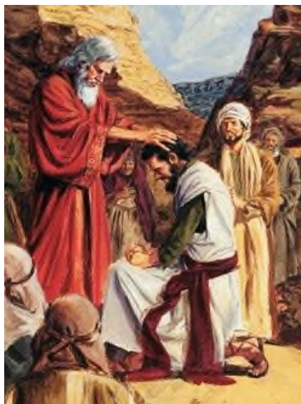
Moses anoints Joshua as his successor.

Many believers today, fed mostly on milk, have little or no idea how to wield their sword. Some can’t even lift it up. On the other hand (literally) they love their shield, because it gives them a place to hide. It is not even necessary to stand to use the shield; one can simply crouch underneath it and wait for the enemy to depart. The sword, however, can be used ONLY by those who stand!