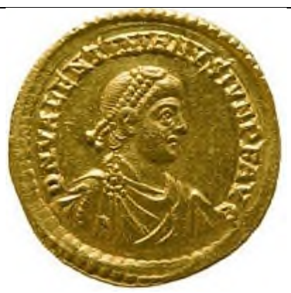
Emperor Valentinian II

As you can see, all of the verses in chapter 13 of Matthew which deal with the kingdom parables – verses 3-50 – are incorporated into this historical overview. What is more, when we recognize that verses 42 and 50 connect two of the parables, we can see that they follow the same sequence as the seven churches described in chapters 2 and 3 of the Book of Revelation.