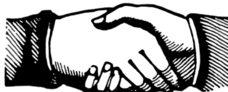
Billy Graham giving a Masonic handshake.