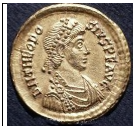
Emperor Theodosius I

Parable of the Net Cast into the Sea (Matthew 13:47-50), which makes a radical distinction between true and false believers. In addition, when Christ explained the Parable of the Wheat and the Tares (Matthew 13:34-43) he did so in a way which runs parallel to the Parable of the Net Cast into the Sea. In each case he refers to judgment in the End Time, where the good are separated from the bad. The latter are then cast “into a furnace of fire” and there shall be “wailing and gnashing of teeth.” (Matthew 13:42 and 13:50).