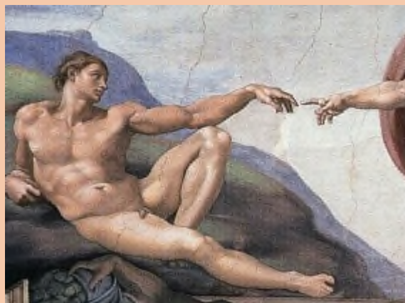
A well-known painting by Michelangelo which subtly predicts the apostasia .

The apostasy then will be of such a nature that the minds of men will be prepared to accept such gigantic claims on the part of a mere man as quite possible and reasonable. The deification of man will be the logical and reasonable outcome of the movement. This throws a flood of light as to what the main drift of the apostasy will be. God will be dethroned and man will be enthroned!