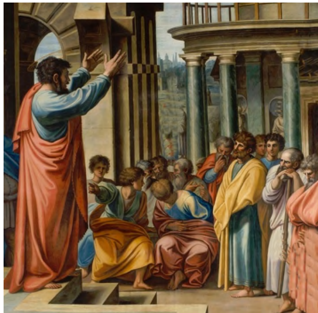
Paul preaching in the Areopagus in Athens.

This is why Christians today are unwilling to give the LORD the glory due unto His name, to come before Him and worship in the beauty of holiness, to go into His tabernacles and worship at His footstool (Psalm 132:7). Wicked and unreasonable men have conjured up idiotic laws to dissuade them, to keep them in bondage and make them subject to the whims and blasphemies of the grand wizards and their gods.