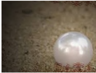
The great price that Christ paid for his Bride.