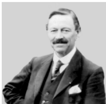
F B Hole (1874 – 1964)

This tremendous energy of Satan will continue but for a short time. The lawless one being revealed on earth, he will be speedily dealt with. The Lord Jesus being revealed from heaven, He will utterly destroy him, casting him alive into the lake of fire, as Revelation 19:20 shows. How appropriate it is that this utterly lawless and disobedient man, the very personification of Satanic energy, shall be dealt with personally by the Lord Jesus, the wholly subject and obedient Man, the personification of the power and majesty of God. No intermediary shall be allowed to intervene in that conflict!