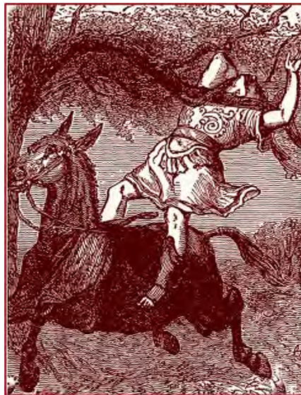
The death of Absalom

How often have we read this passage and given little thought to the fact that the couple had just placed their lives in jeopardy? They had no advance warning, and yet, when the fugitives arrived at their door, they let them in and gave them a place to hide. They had but moments to decide whether to turn them away or to take them in and risk certain death.