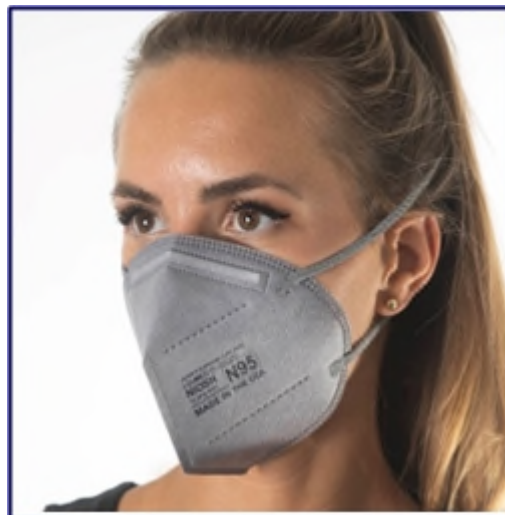
N95 face mask

Later that year he took up an appointment with a major hospital in central London. He also switched from end-of-life care to operational management in nephrology, rheumatology etc. The first case of Covid at his hospital was in January 2020. He initially thought it was just bird flu and not a matter to be concerned about. After a few weeks, before going on holiday to Sri Lanka and Australia, he bought some N95 face masks as a precaution.