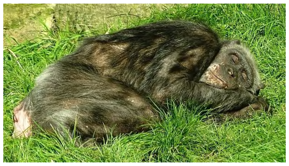
The vibrant church of Laodicea.