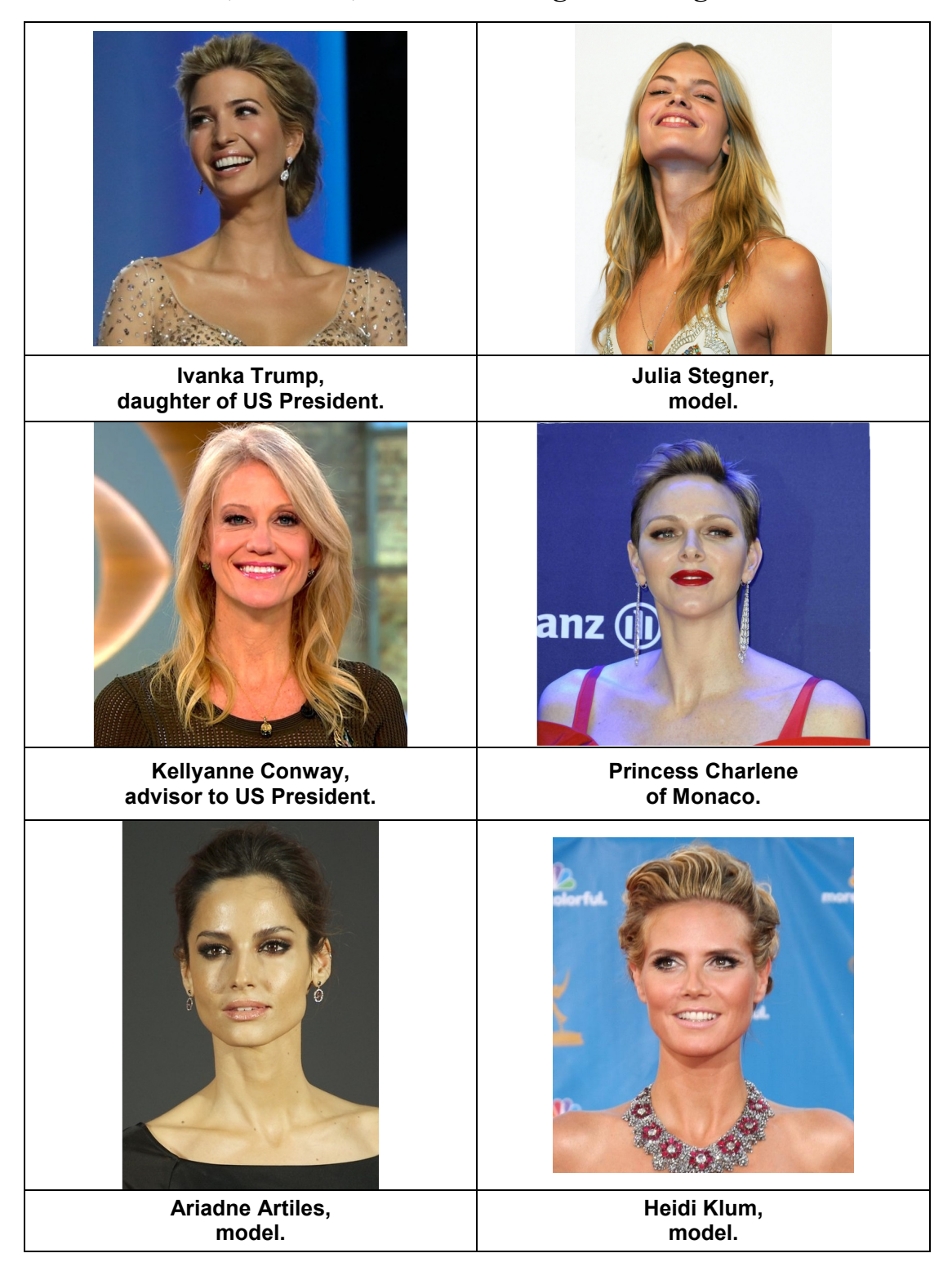
Most, if not all, of the following are transgender:

We have deliberately selected people who continually court public attention, or have done so in the past, such as actresses and models.