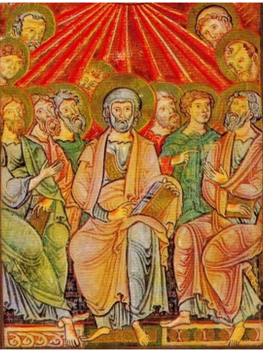
Pentecost, Cluny Lectionary, c.1000

Believers are familiar with the term "the restrainer" which appears in chapter 2 of Second Thessalonians. The relevant Greek word is katechō (Strong's G2722) which, in this context, means to hold back, hinder or restrain. The KJV translates it as "withholder" or "he who now letteth", where "let" is an archaic English word for restrain: