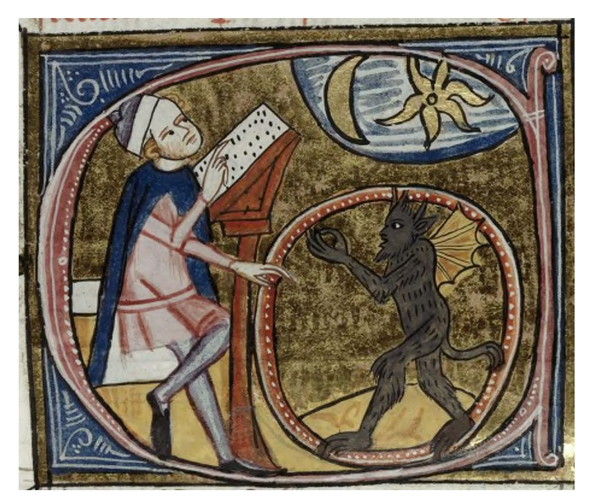
An astrologer looks at the night sky while summoning a demon inside a magic circle. England, 14<sup>th</sup> century.

Remarkably, Jesus goes on to explain what he means by each part of this tripartite mission. It's as though he wants to make absolutely sure that humanity fully understands the role of the Holy Spirit on earth in the coming age.