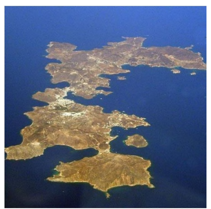
An aerial view of the island of Patmos

Before we conclude this paper it will help to address a few related issues. One of these is the principle of Imminence. Many in Christ today are unfamiliar with this term, which is unfortunate because it encapsulates the "blessed hope" of Titus 2:13. The principle states that Jesus can return for his Church at any time. With one exception (the death of the Apostle Peter), the Word of God never specifies a prophesied event or future condition which must be satisfied before he returns. On no fewer than four occasions in the Book of Revelation Jesus himself said, "Behold [or surely] I come quickly." Three of these are found in the <u>final chapter</u>.