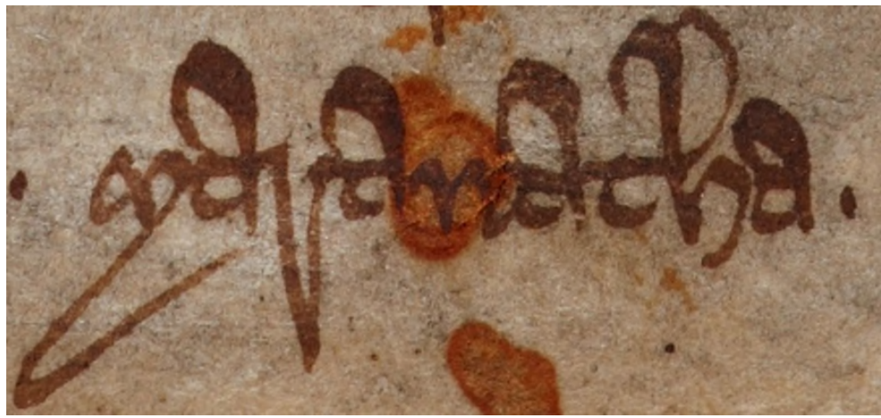
The word 'Maranatha' in a medieval manuscript.

All Christians in the early church, up to the Council of Nicaea in 325 AD, believed without question in the principle of Imminence. As the institutional church increased in power, the principle was gradually pushed aside. Christians were encouraged to look, not to the return of Christ, but to the triumphal evangelization of the entire earth. The Pope, in turn, was increasingly seen as the vicar or representative of Christ on earth, thereby leading believers away from the expectation of our Lord's imminent return.