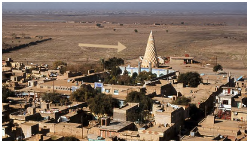
The tomb of the prophet Daniel in Iran, as it was in 1976.

This left only the southern portion, known as Judah (in conjunction with Benjamin). However, they failed to learn from the fate of Ephraim and slid further into rank idolatry.