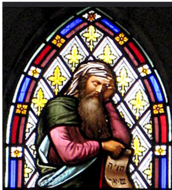
The prophet Jeremiah.

“Do not abhor us, for thy name's sake, do not disgrace the throne of thy glory: remember, break not thy covenant with us.” (Jeremiah 14:21)