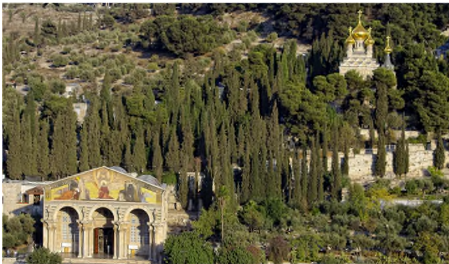
Scene from the Mount of Olives, where Jesus will return to the earth.

To do this he must come upon them suddenly, with overwhelming force. This involves one of his great deceptions, convincing the apostate masters of Israel that they are running the world and are therefore invincible. A large proportion of the Jewish population on earth at this time, as well as those who hate them, already believe this lie.