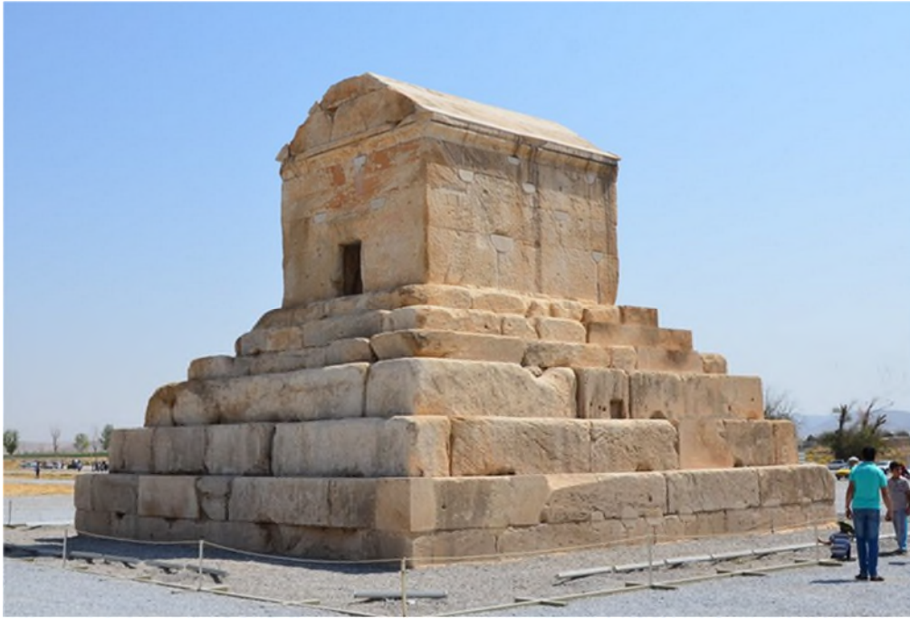
Tomb of Cyrus the Great in modern Iran.

As Christians we need to cleanse our minds by bathing daily in the Word of God. If we do this diligently, we should be able to say – as David did – “O how love I thy law! it is my meditation all the day.” (Psalm 119:97)