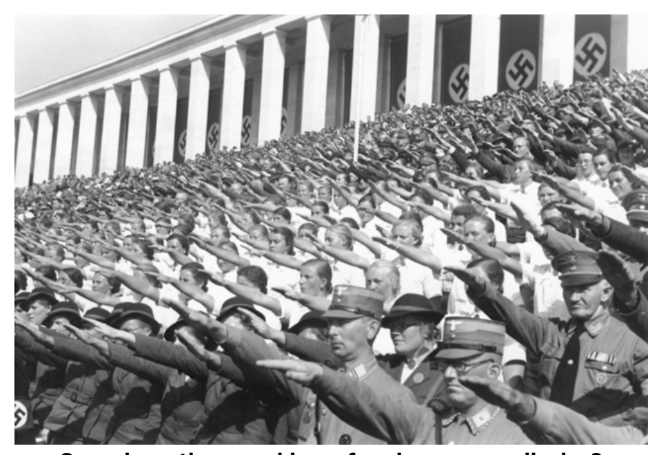
Or perhaps the crowd is performing a yo-yo display?

We make these observations merely to show that America today would be very illadvised to hand the key to its future to a nation with these credentials. Our common sense should tell us this, but alas this precious commodity is in short supply. Our pastors should be warning their flocks of the awful threat posed by Marxism and Demonism, but they are silent: "His watchmen are blind: they are all ignorant, they are all dumb dogs, they cannot bark; sleeping, lying down, loving to slumber." (Isaiah 56:10)