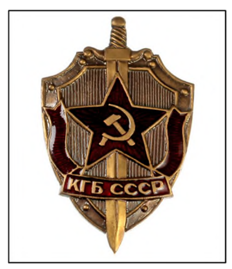
Badge of the KGB

The science of genetics is far more advanced than people realize. What the media are calling "revolutionary new technology" is not new at all. Russia, China and Cuba, along with certain other countries, were developing deadly bio-weapons based on genetic engineering technology as far back as the 1990s. The main Russian center for this work is the Vector Institute in Novosibirsk – see photo and caption on the previous page. The Institute has been using 'messenger RNA' technology for several decades to develop new viruses.