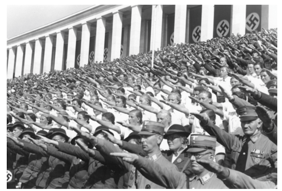
The reality? A blind response to lies, deception and mind control.

We would also note that Emergent BioSolutions is a front for the Biomedical Advanced Research and Development Authority (BARDA), which is responsible for developing biowarfare counter-measures for the U.S. government. As such it has close ties to the Pentagon.