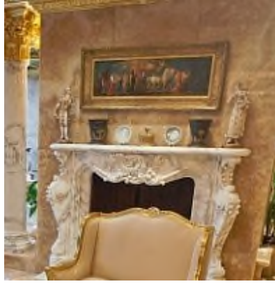
Painting of the sun god Apollo/Helios in Trump's 5 th Avenue penthouse

Freemasonry is essentially a solar cult, where Apollo-Helios-Osiris is revered as the most perfect expression or embodiment of the so-called Light-Giver, Lucifer.