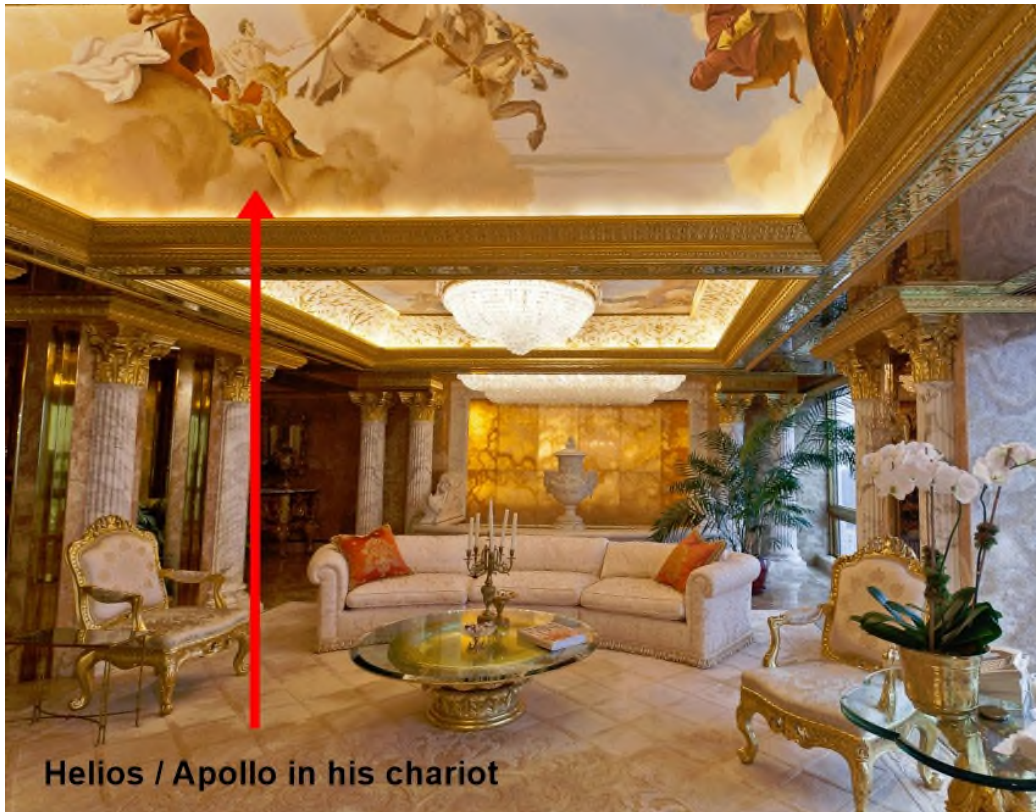
Helios / Apollo in his chariot

Once again, we have Apollo (or Helios) the sun god, in his four-horse chariot, riding across the sky: