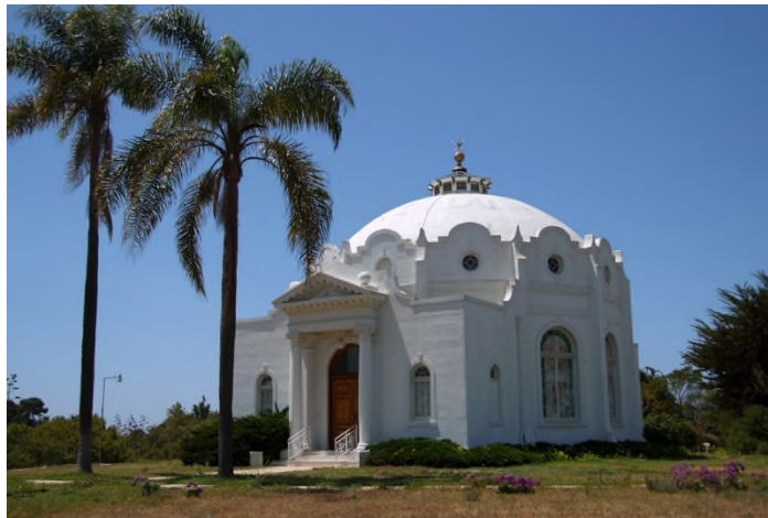
Rosicrucian Temple, Oceanside, California.

President Trump seems to have made a virtue of not being – as far as anyone can tell – a member of a secret society. But this is just a pose. There are many occult secret societies whose membership is never disclosed. For example, many high-ranking members of the Elite are Rosicrucians, but their affiliation is never revealed.