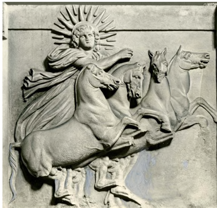
Helios (Apollo) in his chariot, a relief sculpture excavated at Troy, 1872 (in a museum in Berlin).