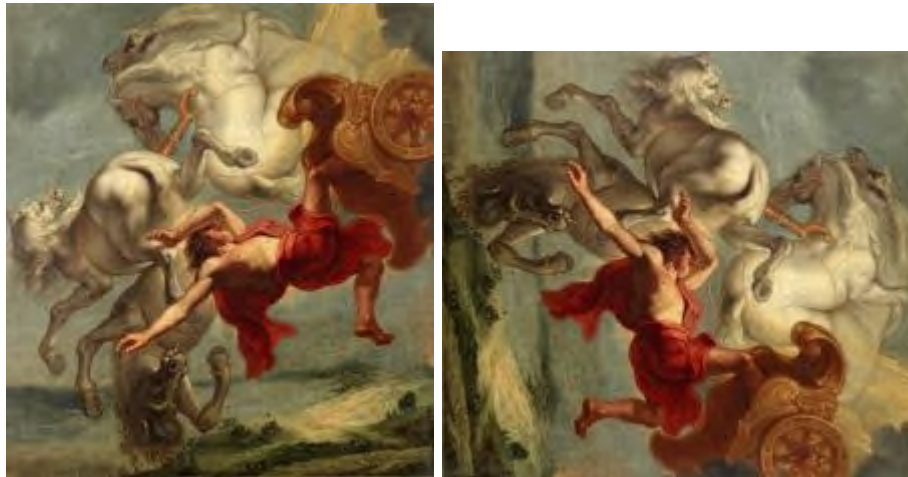
Two views of Jan Van Eyck, The Fall of Phaeton , 1636-38. Museo del Prado, Madrid.

The figure to the right of Apollo/Helios in the above penthouse photo is probably Phaeton, falling from the sun chariot. He was a son of Helios, born from a dalliance with a mortal. One day he tried to steer the chariot himself but was too inexperienced for the task, lost control and fell to his doom. This myth fits with the Illuminati idea that only the best, and best prepared, of men can become gods.