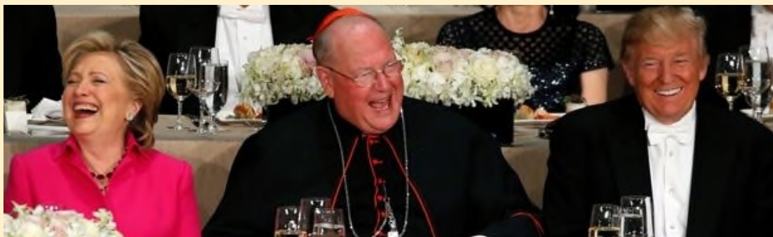
Hilary Clinton, Cardinal Dolan, and Donald Trump in 2016.

“The most senior figure in the [Catholic] church in the US, Cardinal Timothy Dolan of New York” – The Irish Times , 3 October, 2020