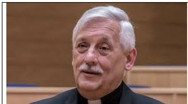
Head of the worldwide Jesuit Order, Arturo Sosa