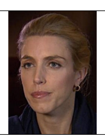
Candy Crowley, CNN