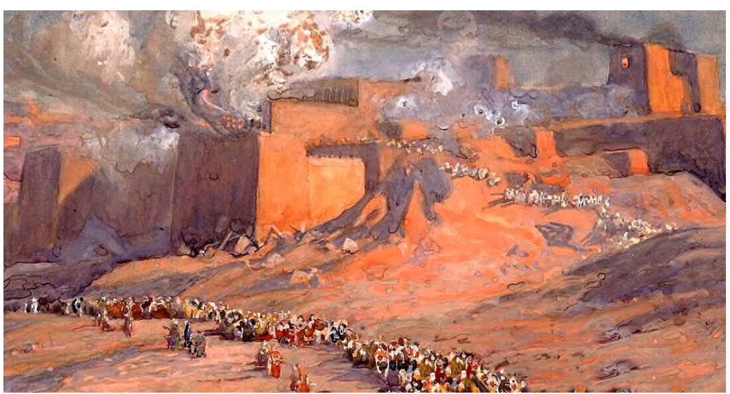
Fall of Jerusalem and the Babylonian captivity, 586 BC

To this we must add their indifference to the plague of sexual exploitation, abuse, abduction, torture and rape of women and children. It is beyond our comprehension.