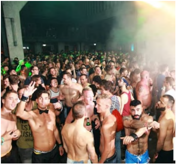
A typical homosexual rave devoted to drugs, mutual masturbation and sodomy.

Next, after a slick PR campaign, in which the Irish media participated with voracious zeal, the Irish public was tricked into approving 'same sex marriage' in 2015. The attack on the family which began in 2012 was moving into a higher gear. Now a marriage between a man and a woman was deemed morally and legally equivalent to a 'marital' relationship between two homosexuals. Bear in mind, homosexual partnerships in Ireland already enjoyed legal recognition for taxation and inheritance purposes, so there was no social or practical basis for what the government was doing. The main aim of the 'same sex marriage' referendum was to demean and defile traditional Christian marriage. The government also made it possible for homosexual partners to 'adopt' a child and thus create a 'family'. By doing so they made procreation an incidental or superfluous aspect of the marital relationship and turned the traditional Christian family into a legal fiction.