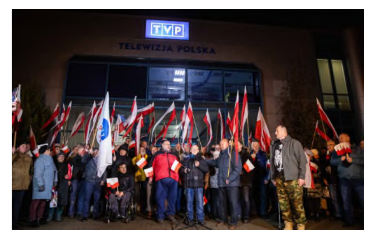
Protestors outside the Polish television station, TVP.

With over 250 reporters and 40 photojournalists the Polish Press Agency (PAP) is the single largest source of news emanating from Poland. When the new Polish government recently took office under the leadership of Donald Tusk, it immediately seized control of PAP, along with the Polish television broadcaster TVP and the national radio station, Polskie Radio. The government claimed that these news outlets were "too politicized." The incoming Culture Minister fired their CEOs and their respective boards, alleging that, since all three were public sector corporations, he had the legal power to do so. This takeover of the national media provoked a sharp response. Critics claimed the government had acted illegally and in contravention of the Polish Constitution. A number of legal experts were also questioning the legality and constitutionality of what the government was doing. While it is generally accepted that the three organizations concerned were strongly biased in favor of the outgoing government party, the radical "solution" adopted by the incoming government is seen as a serious threat to Polish democracy and freedom of the press.