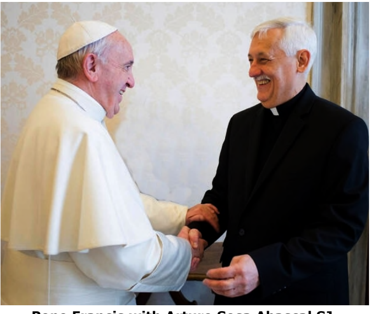
Pope Francis with Arturo Sosa Abascal SJ, current Superior General of the Jesuits. Note the Masonic 'thumb on knuckle' handshake.

At the turn of the 20<sup>th</sup> century, the population of Ireland had a far better understanding of the power exercised by secret societies than they have today. The schemes and goals of the Jesuits and the Freemasons were topics of discussion around the kitchen table in many households, but not anymore. The monster known as Marxism – a joint Jesuit-Freemasonic-Kabbalistic enterprise – has infiltrated the sovereignty of <u>all</u> nations and is close to producing a One World Government.