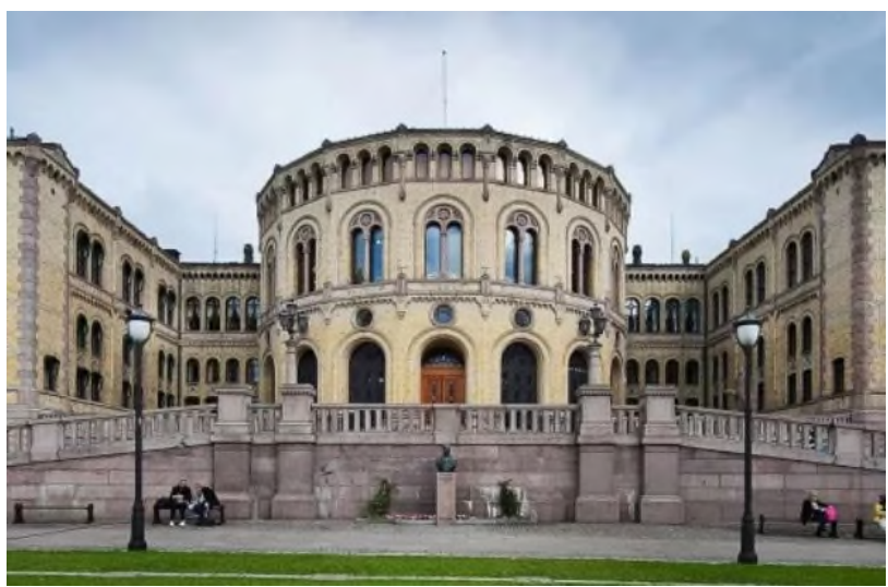
The Storting building, Oslo.

This matter is coming before the Storting at this time because Norway is one of the very few countries not to have ratified the International Health Regulations. Since the globalists are determined to amend the IHR in 2024 – with radical implications for all countries who have ratified them – Norway is obliged to get into line. Their government appears to be doing this in a cunning way, avoiding any reference to the IHR.