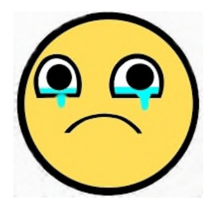
"And God shall wipe away all tears from their eyes" (Revelation 21:4)

The alleged Marburg-Ebola test will likely be used in the same way as the bogus PCR test for Covid, marking as infectious, contaminated and dangerous anyone who tests "positive," even if they are completely asymptomatic. We may witness a new round of lockdowns, far more draconian than the first, with millions of innocent people – all false positives – hauled off to quarantine camps for their own protection and the "greater good." Even those who are not shown to be positive may be relocated from areas deemed by the authorities to be contaminated – please bear in mind that CEPI claims that person-to-person transmission can occur through direct contact with "contaminated objects." Entire towns could be uprooted.