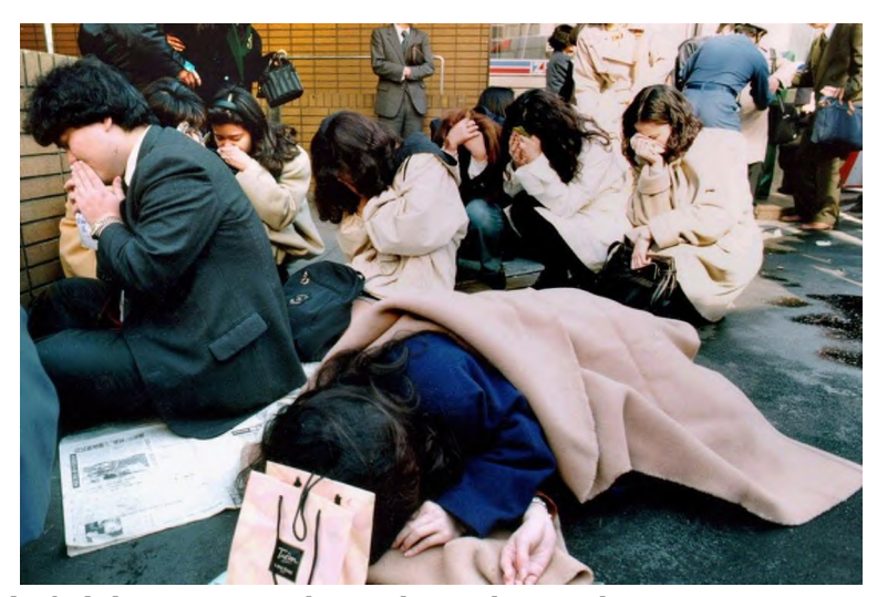
Sarin/Ricin gas attack on the Tokyo subway system, 1995.

For many years the Elite have been warning the world of the great potential threat posed by two deadly diseases, Ebola and Marburg. It has been implied over and over that, if either of these dangerous pathogens mutated into a more contagious form they would cause millions of deaths in a very short time unless a suitable vaccine was developed. The dangers of ricin have also been aired widely in the media, especially after its use by a religiously motivated terrorist group, Aum Shinrikyo, in the Tokyo underground in 1995. Several thousand passengers were injured and about 14 died. Ricin is a highly toxic substance which can be made from castor oil beans by someone with little expertise and only basic equipment. It works by interfering with protein synthesis and leads within hours to respiratory failure. It was first developed by the Nazis for use as a nerve gas which they called 'Sarin.'