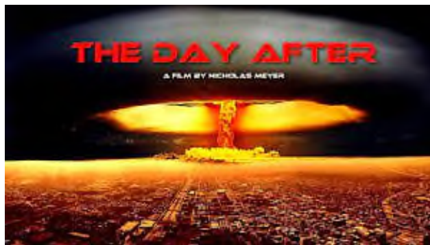
The Day After (1983)