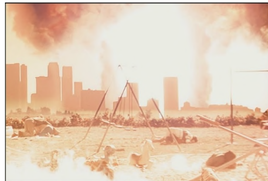
Terminator 2 (1991)

The story is not important. What matters is the imagery. Once these potent, emotionally-charged images are fixed in our subconscious mind, they can influence the way we respond to future events. Those who control the imagery – via television – are able to shape the way the public behaves in a crisis.