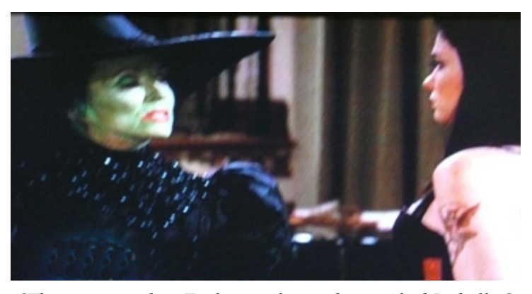
[The moment when Evelyn confronts the terrified Isabella.]

The ensuing discussion between Alan and Charlie clearly implies that Evelyn is dressed as a witch because she is a witch, very likely a Mother of Darkness with absolute authority over Isabella.