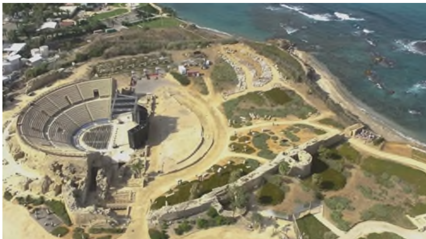
Caesarea Maritima where King Herod Agrippa was judged by God.

“And upon a set day Herod, arrayed in royal apparel, sat upon his throne, and made an oration unto them. And the people gave a shout, saying, It is the voice of a god, and not of a man.” (Acts 12:21-22)