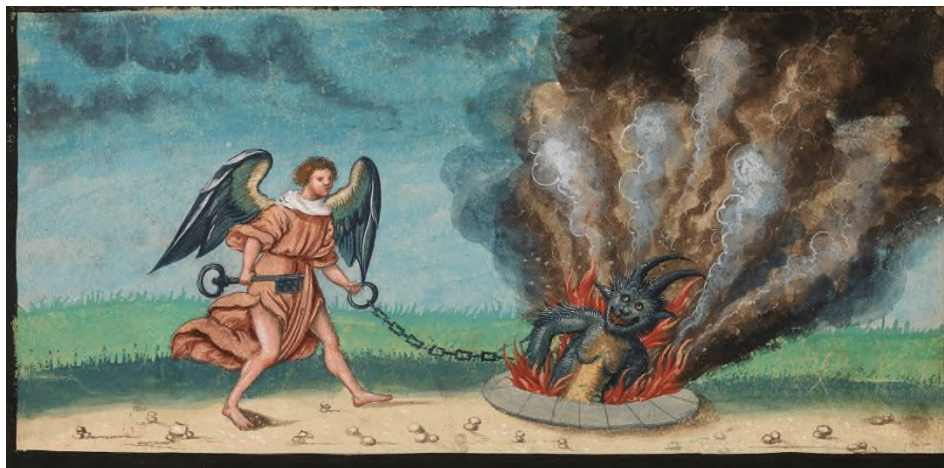
An Angel Chains the Dragon, Augsburg School c 1550

The “man” here denotes the final King of Babylon, the Antichrist himself. How miserable he will appear to those who see him in the depths of hell. For all his horrific destructiveness while on earth, he was never more than a man. Of course, he was imbued for a time with the supernatural power of Satan, but that didn’t last very long. Besides, by this time his demonic master is also in chains, having been consigned to the Abyss for a thousand years!