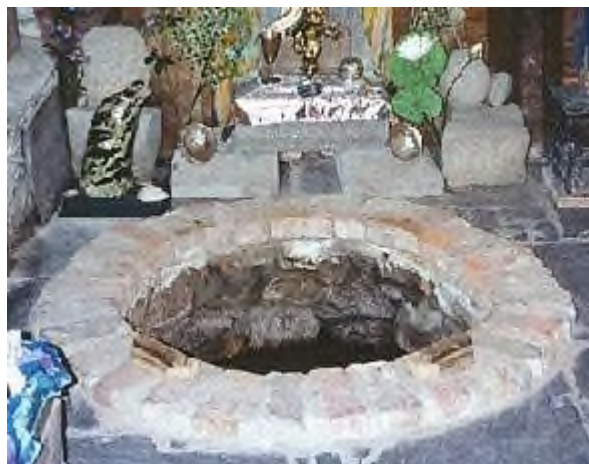
The well uncovered [not broadcast].