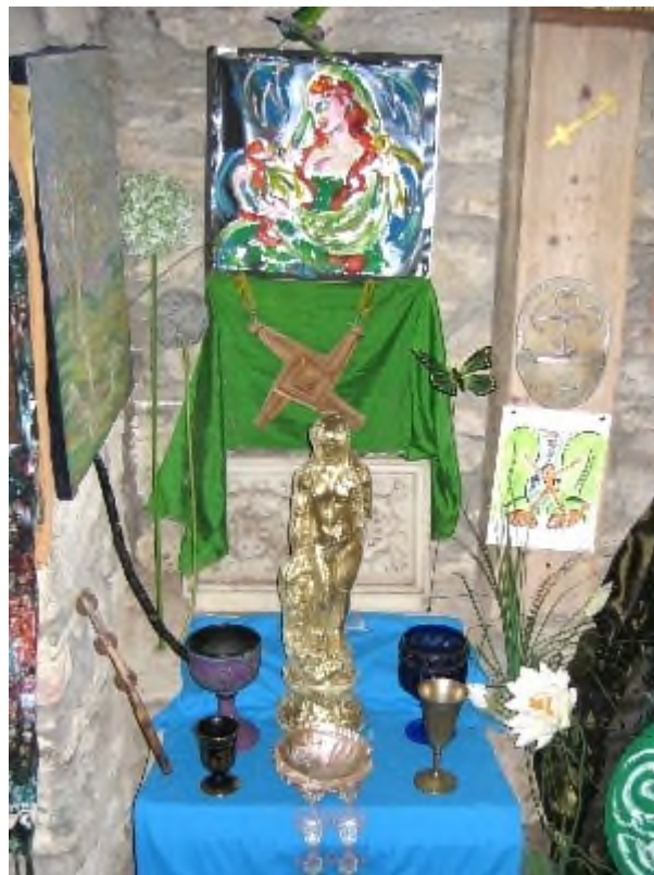
One of the many 'shrines' at the Temple of Isis. This one is in honor of the Irish goddess Brighid.

For those who have chosen the occult path, we have nothing to say. But for those who are being unwittingly lured into Lucifer's lair, we say BEWARE. This stuff is real and can cause real spiritual harm. Under no circumstances should children be admitted to such a place!