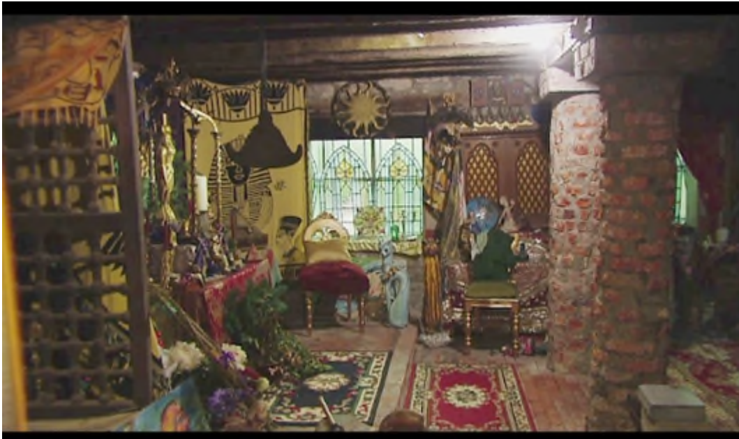
The 'High Altar' of Isis (on left). Seemingly the central focus of ceremonial activity – seasonal rites, initiations, ordinations, and consecrations.