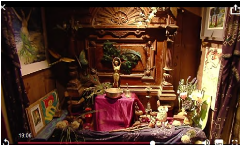
Shrine to a fertility goddess, possibly Brigid or Danu (Dana).