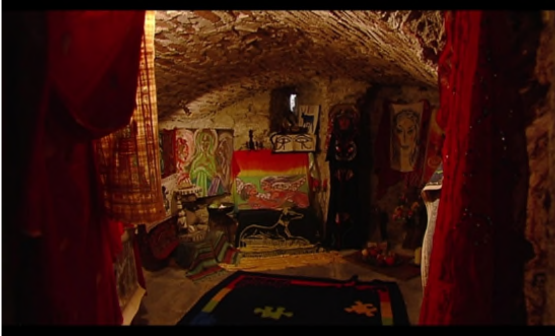
In the 'Cave of the Mothers' a shrine to the Daughter of Gaia of the New Aeon (New Age).