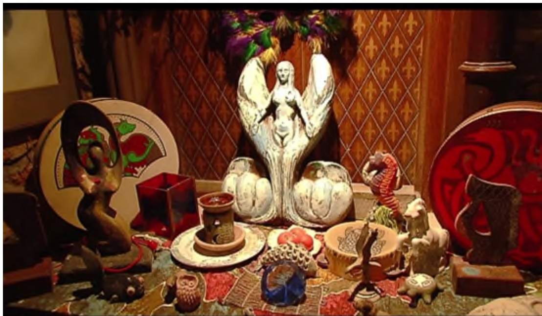
Shrine to a goddess, possibly Athena (see owl) or Aphrodite (see seahorse).