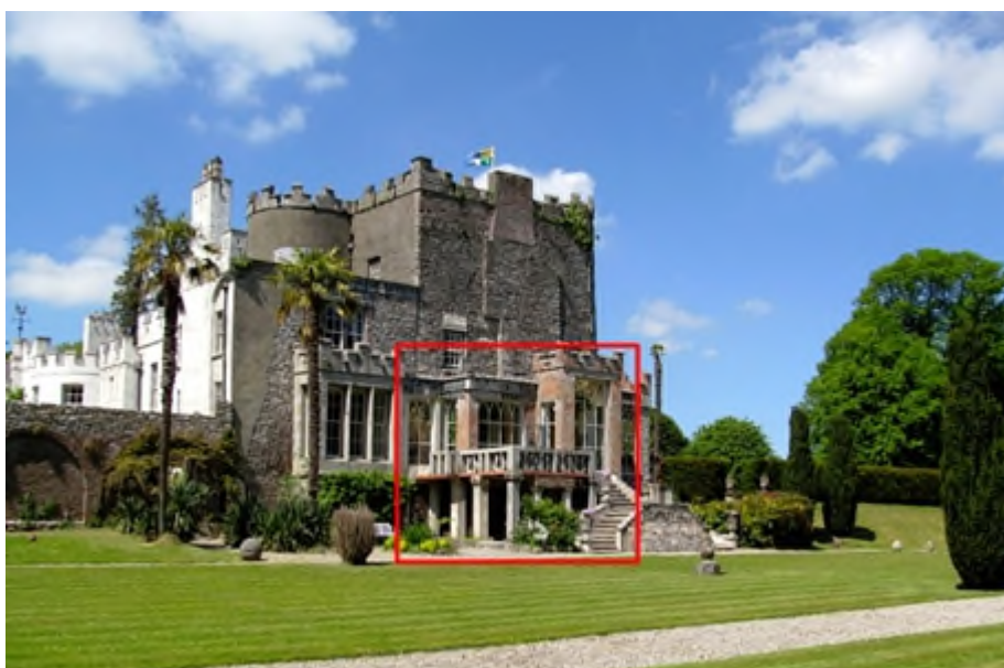
Temple of Isis (in red) at Huntington Castle, Clonmel, Co Carlow.

Please see our earlier papers for a detailed examination of this phenomenon and the many attendant risks (Papers are listed on our website in a numbered Index. See, in particular, #3, #16, #40, #71, #87, #92, and #155.