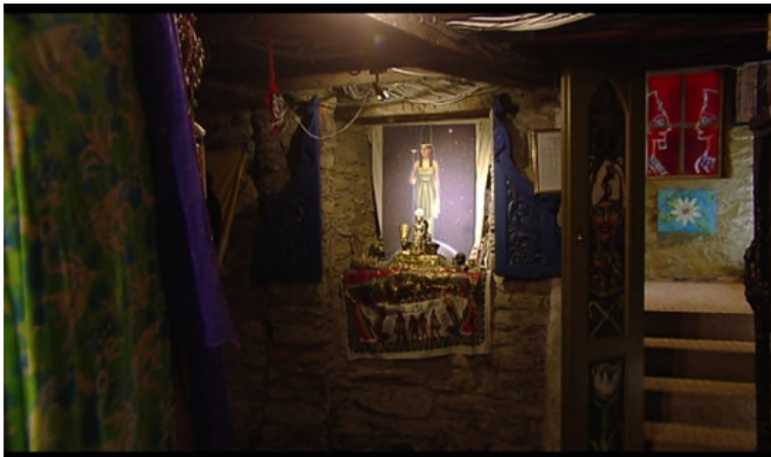
Possibly a shrine to Nuit (or Nut), Egyptian goddess of the starry sky.