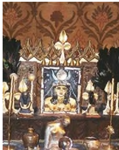
Aztec goddess Coatlicue [left] and Shrine to Ishtar

The RTE program broadcast the following scenes from the Temple: