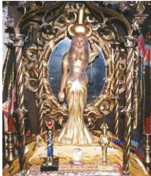
Carved figure of Isis on the 'High Altar.' [not broadcast]