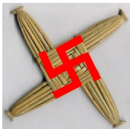
St Brigid's Cross