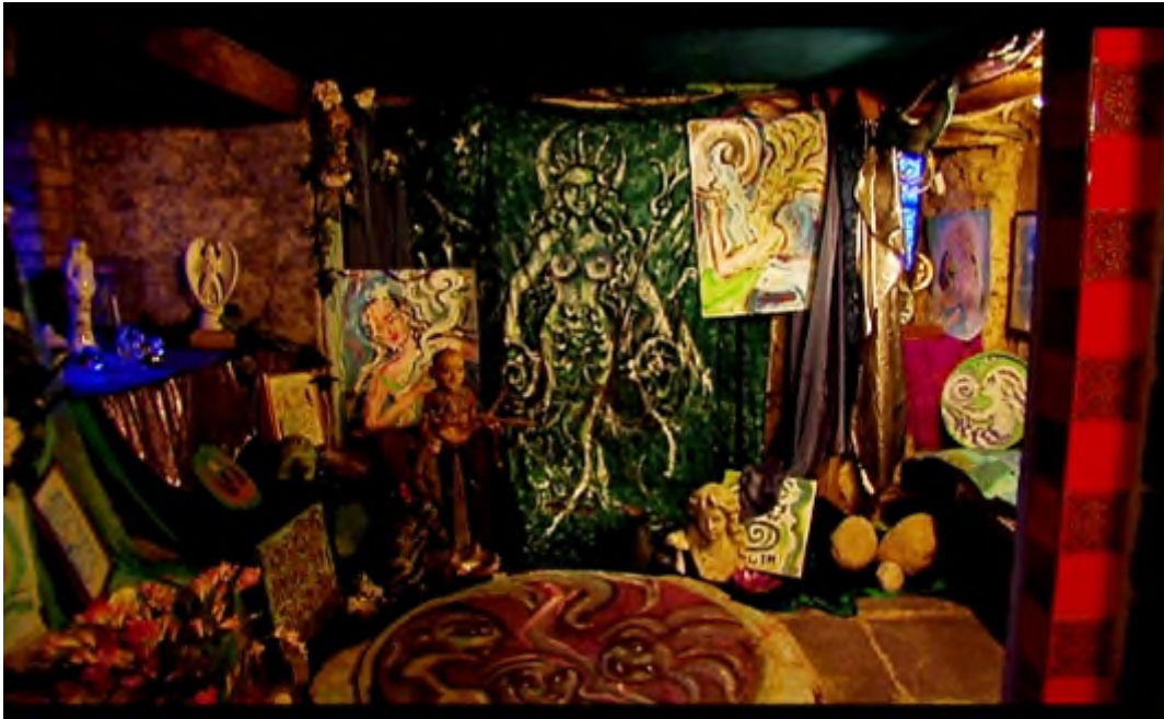
Shrine to Brigid of the Sea. The circular object in front of the painting is the cover of an actual well beneath the floor of the Temple, known as the Well of Brigid. Water taken from the well, which is 17 feet deep, is used in ceremonies and for “promoting psychic vision.” The so-called Chapel of the Well is one of the five main chapels in the Temple. Ancient Druidic rites are performed in this chapel at certain times of the year.