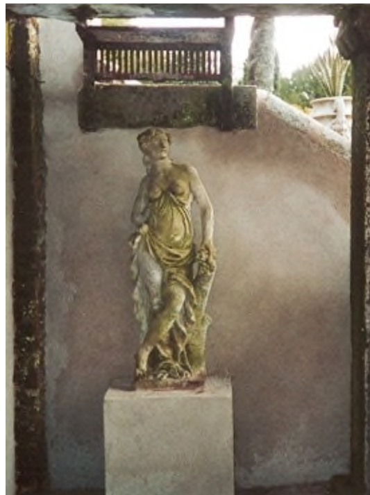
Statue of Persephone at the entrance to the Temple of Isis. The official website of the Fellowship of Isis describes her as “the Queen of Hades.”

Perhaps the most disturbing aspect of the grossly misleading information given by RTE is the perception that children could be safely taken to such a location by their parents. This is a very serious violation of broadcasting ethics. The Temple of Isis at Huntington Castle is a place where one or more covens of active witches meet on a regular basis to summon demons, or have done so for a considerable period in the past. It is therefore a demonic stronghold, a place where the fallen angels have established a base of operations, and have done so because humans have given them permission.