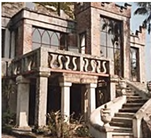
Portico of Temple of Isis

Do you see a problem with this? Clearly RTE did not since this part of the program was presented with the same insouciance and informality that characterized the program as a whole. The viewer was led to believe that the ‘Temple’ was nothing more than an eccentric diversion to amuse the many tourists, young and old, whom it was hoped would flock to these locations in the years ahead.