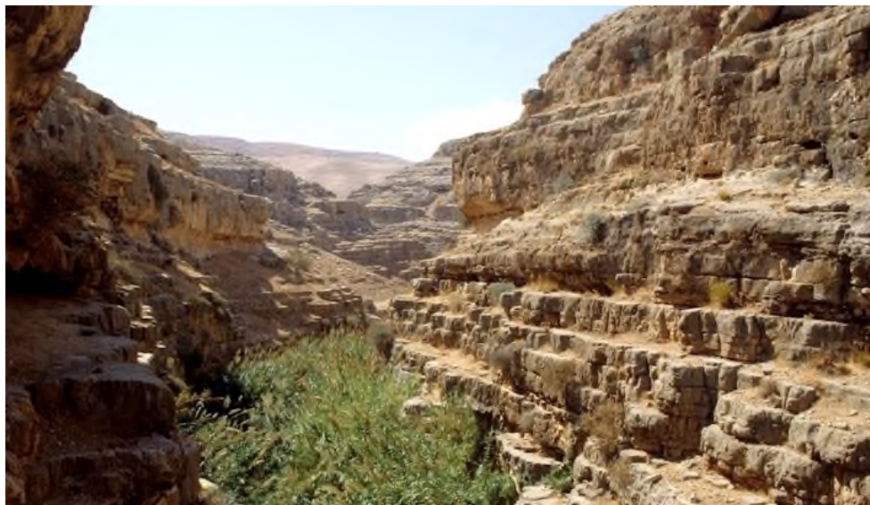
The valley of Achor, where Achan confessed his sin.

“Now the God of peace...make you perfect in every good work to do his will, working in you that which is wellpleasing in his sight...” (Hebrews 13:20-21)