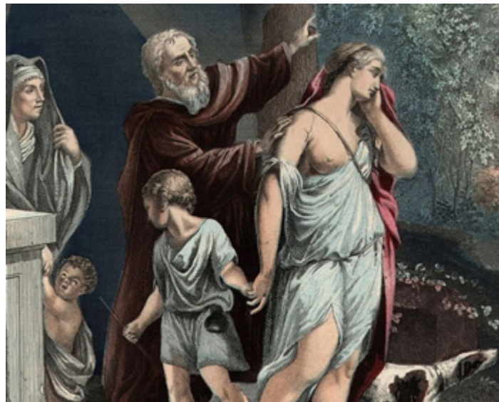
Abraham evicts Hagar on the insistence of Sarah following the occasion where Ishmael "mocked" Isaac – see Appendix A .

What is the most common and persistent expression today – or any time – of our debased human imagination? It is sexual perversion in all its forms. Sexual fantasies and desires of every kind, including the most depraved and unnatural, are produced with ease by our fallen imagination. And unless we exercise control over this perverse and rebellious faculty, it will control us.