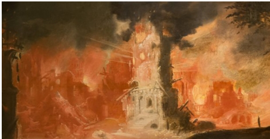
The destruction of Sodom.

"For there are certain men crept in unawares, who were before of old ordained to this condemnation, ungodly men, turning the grace of our God into lasciviousness, and denying the only Lord God, and our Lord Jesus Christ...Even as Sodom and Gomorrha, and the cities about them in like manner, giving themselves over to fornication, and going after strange flesh, are set forth for an example, suffering the vengeance of eternal fire. Likewise also these filthy dreamers defile the flesh, despise dominion, and speak evil of dignities...But, beloved, remember ye the words which were spoken before of the apostles of our Lord Jesus Christ; How that they told you there should be mockers in the last time, who should walk after their own ungodly lusts. These be they who separate themselves, sensual, having not the Spirit." (Jude 4, 7, 8, 17-19)