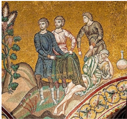
Shem and Japheth cover the nakedness of Noah after he is homosexually abused by Ham's son, Canaan – see Appendix A