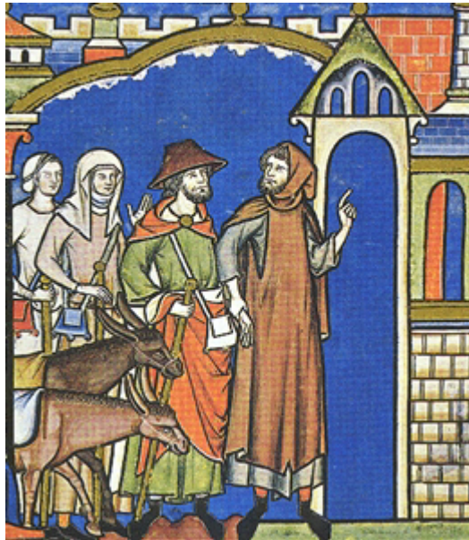
The Levite arrives at Gibeah.

One would have thought that what the Bible teaches about homosexuality would be well understood by the majority of Christians today, but this is not the case. This serious deficiency would seem to have three unrelated causes: (i) few Christians study Scripture as they should and so they lack the basic skills needed to deal adequately with this topic; (ii) by glamorizing sodomy the Enemy has made it very difficult for Christians to speak about it without seeming to be hampered by irrational prejudice; and (iii) the traditional Biblical teaching on sodomy was never deemed by theologians to warrant an in-depth study, primarily because its abominable character was fully evident to anyone who lived and believed God's Word.