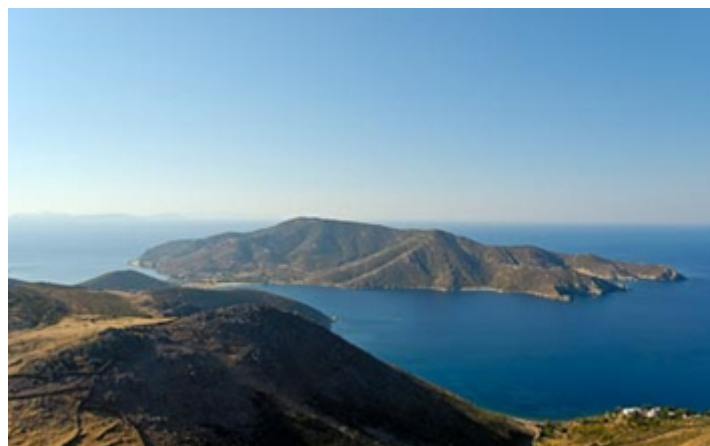
The island of Patmos, where the Apostle John wrote the Book of Revelation

A 'dog' is a sodomite in a pagan temple, the passive participant in the anal sex act. The Word of God is telling us that the money he receives is an "abomination" unto the LORD, which means the act itself must be even more repugnant than the word "abomination" can convey. As Gesenius says, the word 'dog' is used to denote a male prostitute since his behaviour is as shameless as that of a dog.