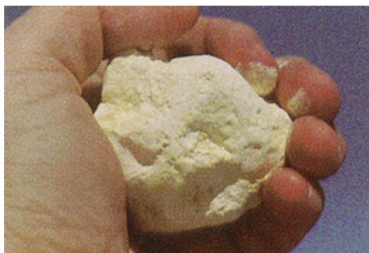
Sulphur balls just like this can still be found in the plain west of the Dead Sea.

Having said that, Christians have a legitimate right to express their concerns about the health implications for society of the homosexual lifestyle, the measures taken by homosexuals to induct young people into a life of sodomy, and the campaign of hatred that radical homosexuals are conducting against anyone, especially Christians, who raise concerns of any kind about their homosexual behavior.