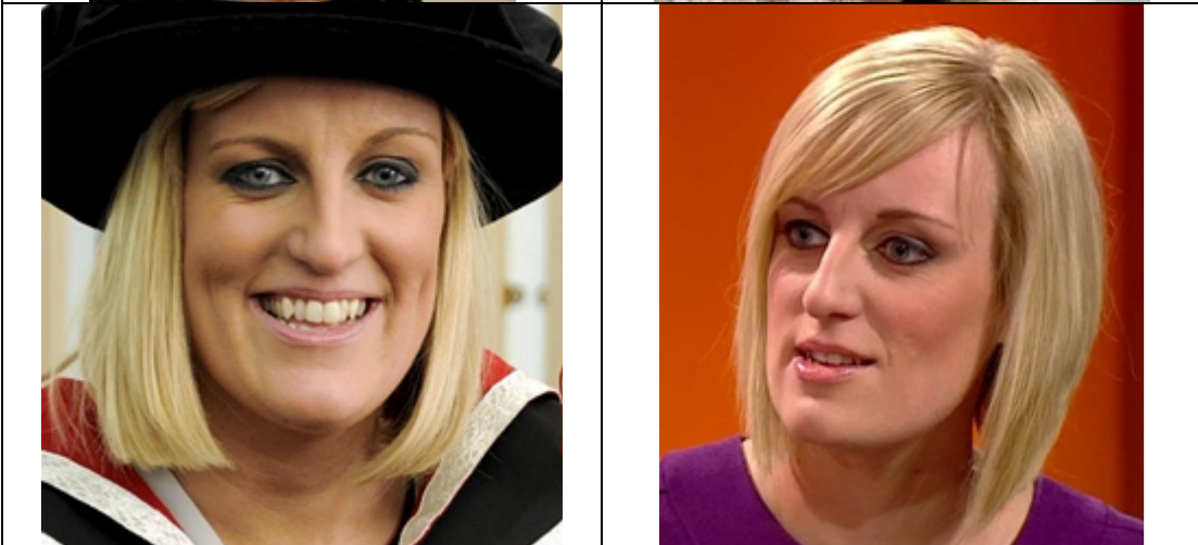
Top: Sally Gunnell Middle: Selena Scott Bottom: Steph McGovern