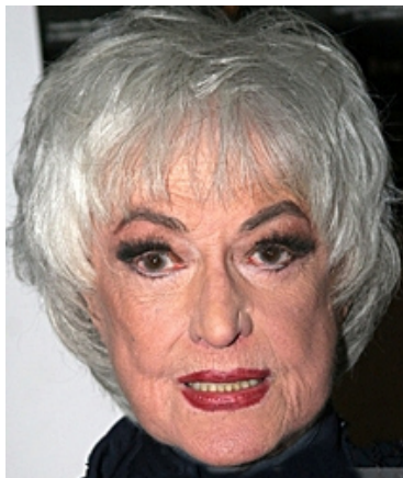
Secretly transgender 'woman' Bea Arthur

In my estimation the following television programs, to name but a few, have all used transgender female-to-male 'actors' and male-to-female 'actresses': Eastenders (BBC), Coronation Street (ITV), That Seventies Show (Fox), Are You Being Served (BBC), The Golden Girls (NBC), Will and Grace (NBC), Gilligan's Island (CBS), Lost in Space (CBS), The Avengers (ITV), Sex and the City (HBO), Friends (NBC), The Lucy Show (CBS), How I Met Your Mother (CBS), M.A.S.H. (CBS), Cagney and Lacey (CBS), and Dawson's Creek (Sony). The hubris of these corporations is really striking at times. For example, NBC cast the oversized, deep-voiced, unashamedly masculine Bea Arthur as 'Dorothy Zbornak' in The Golden Girls :