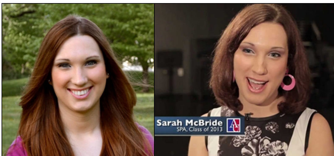
Openly transgender 'woman', Sarah McBride.

A few weeks ago the political activist, Sarah McBride, became the first openly transgender 'woman' to address a national political convention (DNC, Philadelphia, 28 July 2016). Vice President Joe Biden publicly congratulated 'Miss' McBride on his pioneering debut.