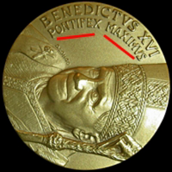
Vatican commemorative coin, 2008, describing Pope Benedict XVI as Pontifex Maximus