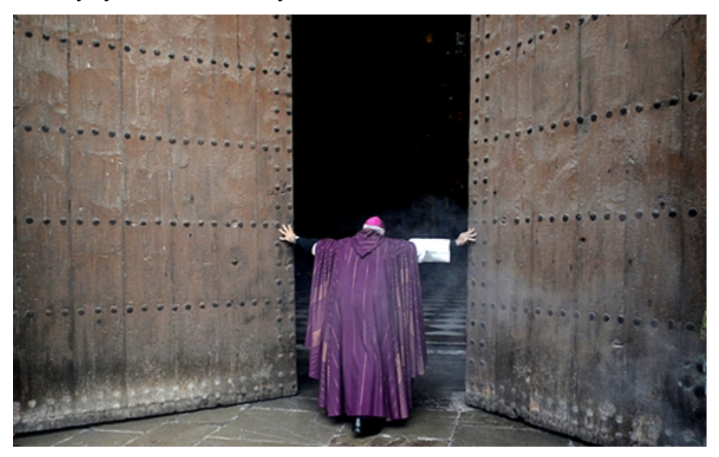
The gates of hell? A troubling foretaste of what lies ahead.

This effectively created a temporary worldwide network of over 2,800 supernatural doors . These were in addition to the forty or so portals that have been designated <u>permanently</u> by canon law as 'Holy Doors'.