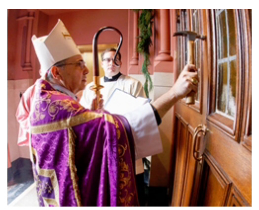
A Catholic bishop in Boston uses a ritual hammer to knock three times on a Holy Door on 13 December 2015.

The 'faithful' who passed through the Door of Mercy (or similar doors in other parts of the world) between 8 December 2015 and 20 November 2016 – probably numbering tens of millions – could earn indulgences , a Catholic doctrine which claims that the effects of sin can be off-set by certain meritorious acts and one's suffering after death reduced accordingly. So, any Catholic who made a 'pilgrimage' to Rome and passed through the Door of Mercy would not be required to spend quite so long in the afterlife state known as purgatory.