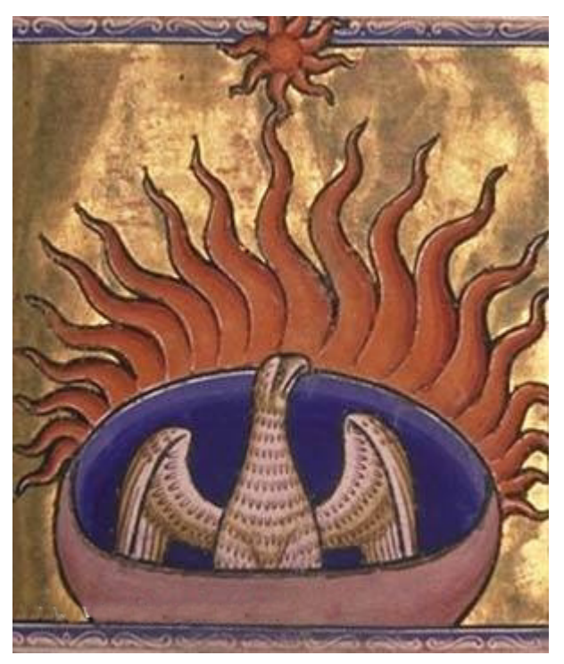
Aberdeen Bestiary Manuscript, c1200

The scaffolding even gives the dome an uncanny resemblance to the Tower of Babel, as depicted in many famous paintings.