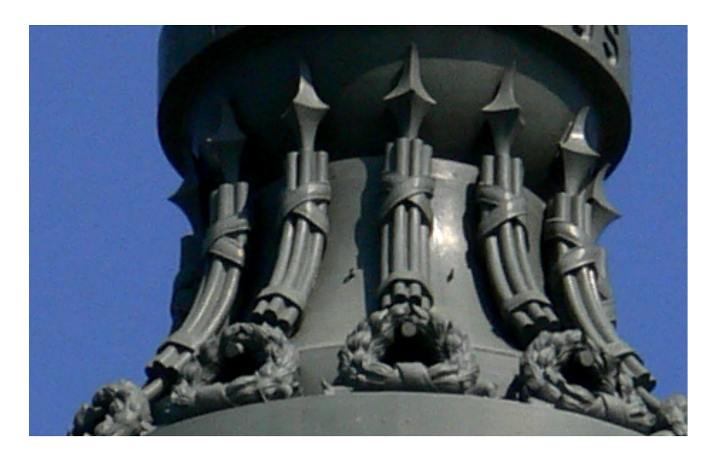
The word 'fascist' comes from 'fasces', meaning a totalitarian form of government. The NWO will be underpinned by a totalitarian government or fascist regime, just as the ironically named Statue of <u>Freedom</u> foretold.

Note the circle of 'fasces' on which she stands: