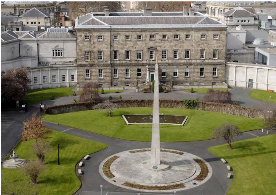
Leinster House, seat of the Irish legislature, replete with Masonic obelisk.

But what if, heaven forbid, a representative number of Irish citizens were to raise their hands and ask some pertinent questions about this poisonous agenda? Well, that sounds awfully like 'freedom of speech', which is something all Marxists despise. The vipers in Leinster House will need some way to silence dissent – should it ever emerge!