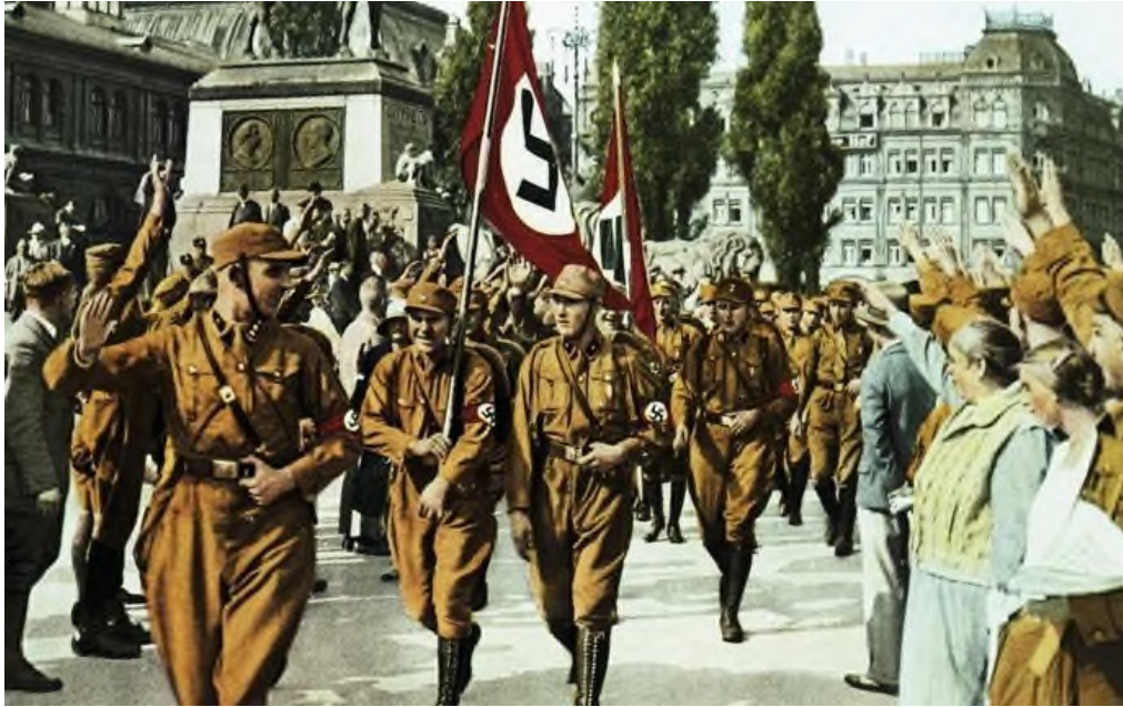
Brownshirts marching in Nuremberg, 1929

The old Catholic Encyclopedia gave a bitter assessment of the Penal Laws in Ireland in the 18 th century: “The law presumed every Catholic to be faithless, disloyal, and untruthful, assumed him to exist only to be punished, and the ingenuity of the Legislature was exhausted in discovering new methods of repression.”