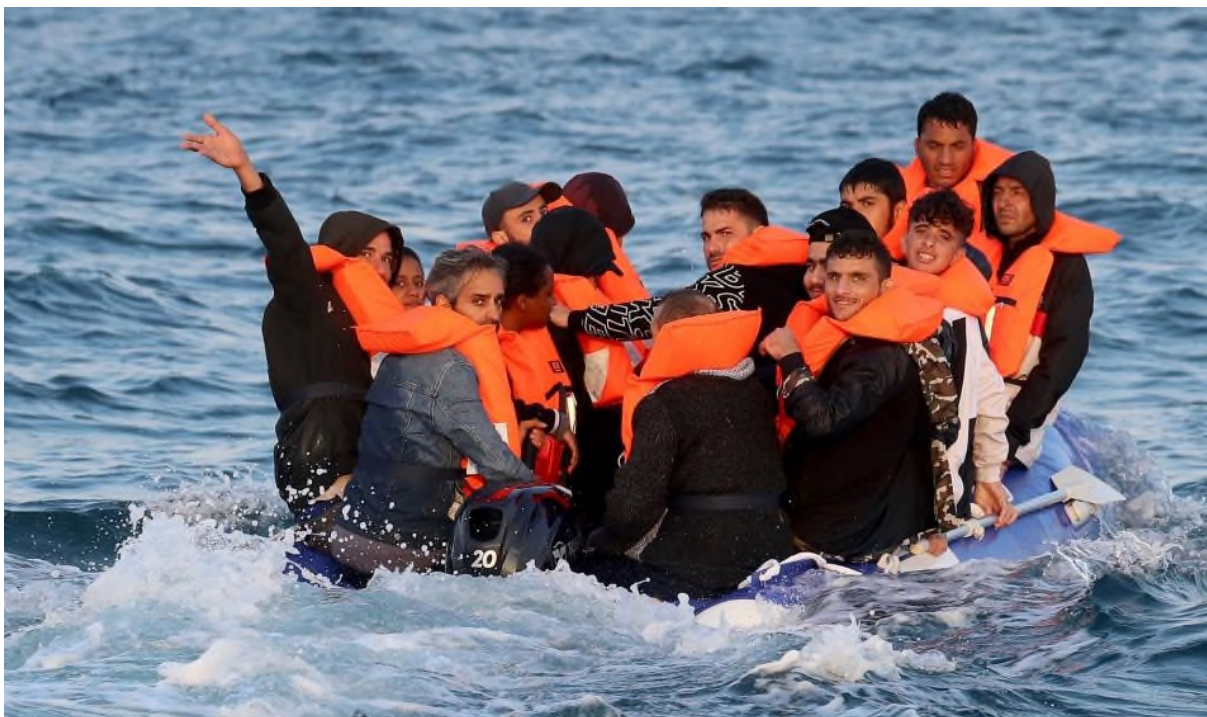
Illegal migrants, mostly fit young men, approach the English coastline in 2022. They seem confident that the authorities will not do much to prevent them from entering the UK.

We believe many countries have counter-insurgency troops in place already . They could have crossed the border in the guise of ‘migrants’ and been assigned to cities and towns across the country. As we noted above, a large proportion of these ‘migrants’ and ‘refugees’ are fit young men, many of whom may already have received military training in their country of origin.