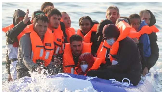
They keep coming.

The same would seem to be happening in the UK. Boatloads of fit young men arrive in the UK every day, most of whom appear to be from Eastern Europe or the Middle East. A small number are 'detained' by immigration officers at Dover and sent back to France or – if you would believe it – Rwanda, but the vast majority merge quietly into the population. A great many more arrive by night along the east coast, uncounted and undetected. This has been happening continuously for several years under the tightly shut eyes of the UK government.