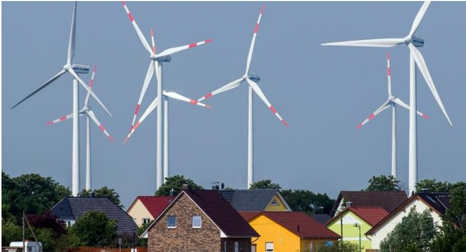
Inefficient and unreliable wind turbines in a German town. These ridiculous structures are very costly to erect and maintain.