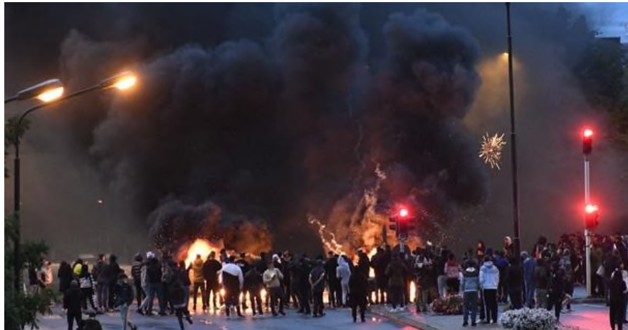
Islamic Malmo, 2022. Malmo is one of Sweden's largest cities.

Severe damage has been done to the social fabric of Sweden by legal , government approved immigration. Large Islamic enclaves have developed and the national crime rate has soared. A sizeable proportion of the population of France, Belgium, Germany, Denmark, and the Netherlands is now Islamic. The risk that this poses to the future stability of these nations hardly needs to be cited. An ever-growing non-integrating ethnic group, with a strong antipathy to Christianity and Christian values, is certain to pose a future threat to national security if and when appropriate methods of incitement are used. These enclaves are powder kegs with a short fuse.