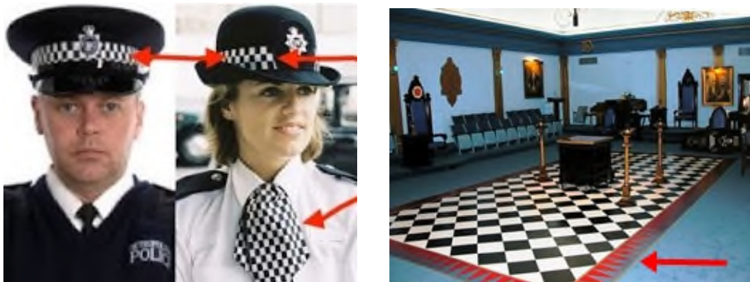
Hidden in plain sight. The Freemasons control the British police force.

It is estimated that there are around one million illegal immigrants in the UK, comprising men, women and children. If only 5 percent of these are part of an undercover militia, they still amount to a force of 50,000 men. The total number of police officers in the UK is 135,000, down from 170,000 ten years ago. So, while the hidden threat is growing, the number of police officers is falling. Furthermore, given that a large percentage of police officers in the UK are Freemasons, including virtually every officer of senior rank, the possibility that a meaningful number might question the authority of the government is very remote.