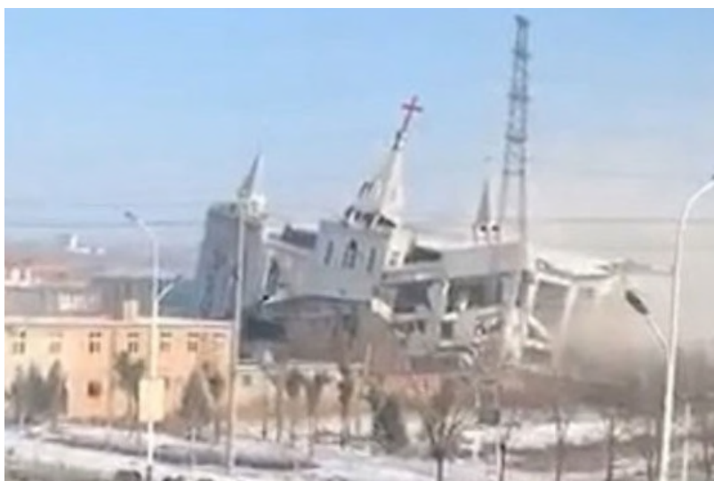
State officials demolish an evangelical church in China.

It is obvious from these draconian controls that the Gospel could not be preached in a Three Self church and that apostate versions of Christianity, such as Eastern Lightning, were bound to flourish. Nevertheless, it is generally accepted that a sizable if unknown number of members of these churches were or became true believers. These were in addition to the millions who came to faith through the underground or home church movement.