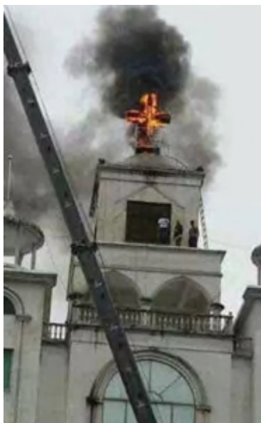
One of possibly thousands of church crosses forcibly removed by the state under the new policy approved by Xi Jinping.

The pressures that are being applied to Christians to conform to the will of the CCP can take many forms. These include fines and other financial penalties, home visits by the police or state officials, loss of church buildings, destruction of church property, withdrawal of authorisation to convene for religious purposes, the loss of certain state entitlements and subsidies, and even the threatened stoppage of water and electricity. There are also many reported instances where Christians or church leaders have been held in police custody or given a prison sentence, in one case a sentence of 13 years.