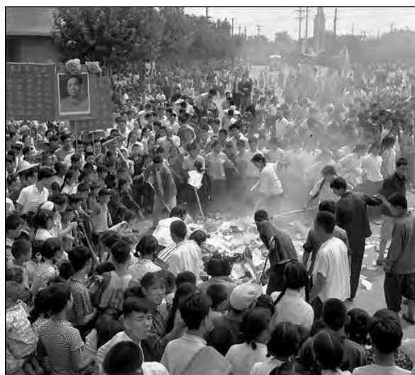
Burning books during the ‘Cultural Revolution’

This attitude is already evident in the approach taken in several parts of China earlier this year where Christians visiting from overseas were taken into police custody for a time and then deported for engaging in religious activities and participating in “illegal gatherings”. Foreign students are also being investigated to determine whether they are Christian and, if so, what activities they are engaging in. In future, evangelism in college campuses will not be tolerated.