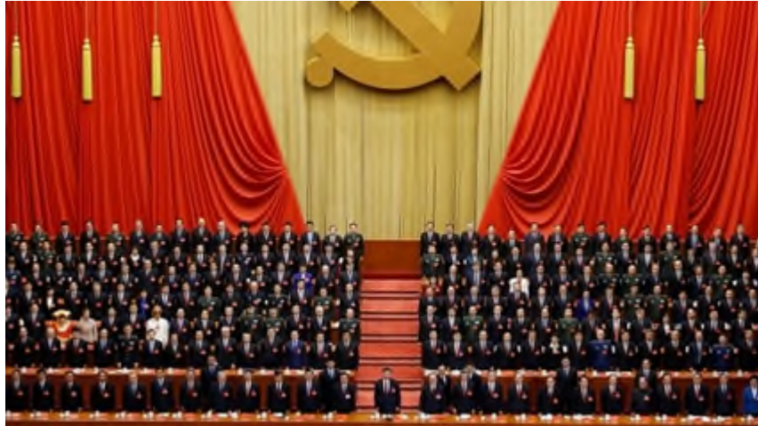
Xi Jinping (center front) at 19 th CCP National Congress in 2017.

About twenty years ago, a western financial correspondent was discussing the renascent China with one of its first female millionaires. A member of the Chinese Communist Party, she was very successful by any standard. Her private company had become the largest aluminum alloy wheel manufacturer in Asia. She was outgoing, well-spoken and enjoyed telling the story of her success. She even had a Rolls Royce and a Mercedes. The correspondent was learning a lot about China's economic revolution, but when the conversation turned to the Party, she suddenly switched from lively entrepreneur to obedient automaton. As he put it: "To even the gentlest of questions, she adopted a reverential, whispering-in-church tone. Her answers became sombre, restrained and drained of life, consisting of little other than official slogans."