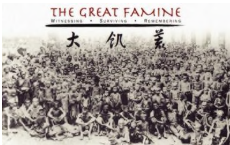
The Great Famine in China, 1959-1961 in which 30 million people died. This horrific catastrophe was a direct result of Mao’s ‘enlightened’ policies, much praised by Rockefeller.

For Christians who doubt the existence of a co-ordinated worldwide program to destroy Christianity, the Sinicization plan for religion in China should act as a wake-up call. The same ultra-wealthy international cartel who set up China in 1948, and who control it still, are also controlling the world economy. The same cartel that ‘off-shored’ almost half of America’s industrial base to this subversive Marxist state, and who allowed the same Marxist state to accumulate staggering trade surpluses using a grossly undervalued currency, have a similar plan for Christianity in the United States.