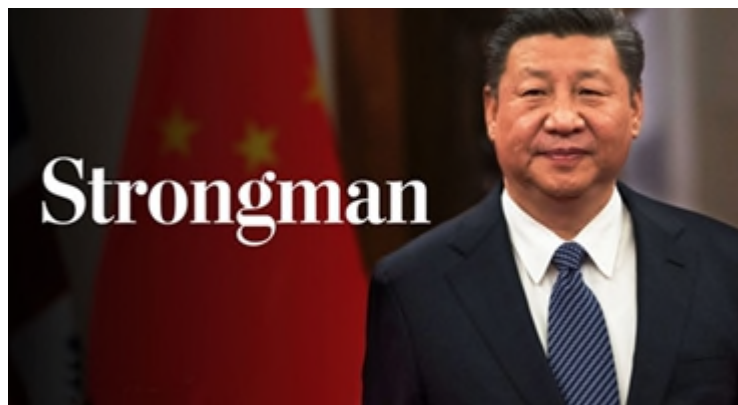
Photo of Xi Jinping in The Washington Post , February 2018, with the word ‘Strongman’ – see our paper #173

This was the first time since Mao that a living Party leader had an ideology named after him and enshrined in the Constitution. It came as no surprise that the Constitution was later amended to remove the term limit on the office of General Secretary, thereby allowing Xi Jinping, with effect from March 17 th , to rule unopposed until his death. For this reason Forbes now dubs him the most powerful man in the world.