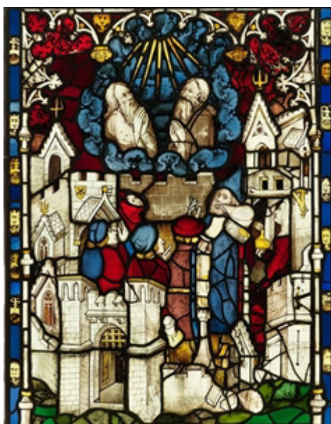
The Two Witnesses ascend into heaven.

The Two Witnesses will be reviled in the international media and their words and actions distorted in the most outrageous ways. The world will see them much like villains in a reality TV show, religious phonies whose antics both amuse and offend at the same time. As the first half of the Tribulation unfolds and the world as a whole falls more and more under the spell of the Antichrist, the Two Witnesses will be increasingly hated by almost everyone.