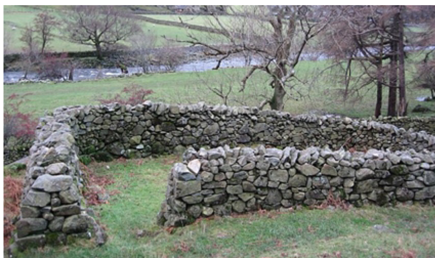
Sheepcote (N.B. Gate not in picture)

The Greek word for "hour" in verse 13 is hora (Strong's G5610). This word appears 108 times in the New Testament and is translated in the KJV as "hour" 89 times, "time" 11 times, "season" 3 times, and in other ways 5 times. It may not refer in this instance to an event taking place in the same 60 minute period, but (as we use the term today) to events in close proximity. Seen in that light, the earthquake may occur a few days after the Two Witnesses ascend into heaven, perhaps immediately after the abomination of desolation. (The 7,000 slain in the earthquake may have been soldiers of the Antichrist.)