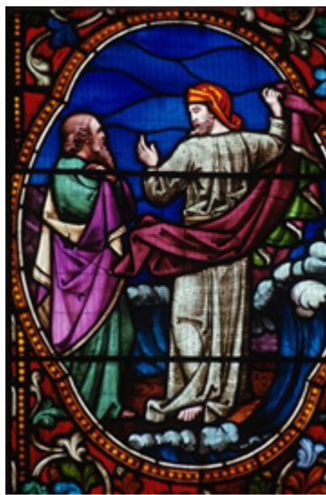
Elijah parts the Jordan.

Given the enormous spiritual importance of this event – not just for Israel but for the whole of mankind – it is significant that the Jordan was also parted on two other occasions, both on the same day , on the first occasion by Elijah and on the second by Elisha. In the language of the Bible, this conspicuous day would seem to be pointing to an even more momentous day sometime in the future involving these particular individuals.