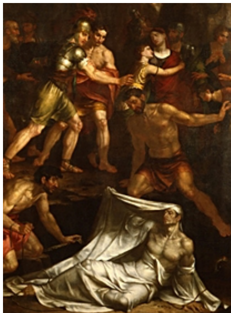
The corpse revives when it touches Elisha's bones.

We can hardly conclude that the prophet failed to complete the two assignments but must infer, rather, that they were the responsibility of his office and could therefore be carried out by his divinely appointed successor. The acts of Elisha were, in effect, recognized by God as the acts of Elijah. Thus we have two illustrious prophets sharing, in succession, the same prophetic office.