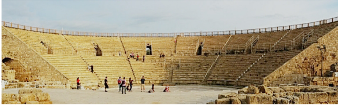
The amphitheatre at Caesarea where King Herod Agrippa was struck down by an angel of God.

When Herod Agrippa accepted the acclamation of deity, he was struck down by an angel of the LORD. As soon as the Antichrist does the same, he will commit a heinous deed which instantly destroys his holy façade. The man who, up to that point, had deceived the whole world through his false humility, his seeming piety and his supernatural charisma, is suddenly revealed for what he is, a brutal tyrant energized by Satan himself.