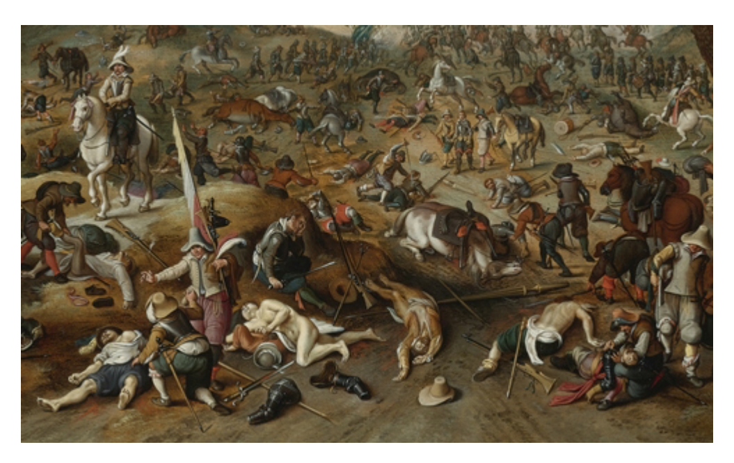
Detail from a painting by Sebastian Vrancx and Jan Breughel the Younger of the Thirty Years War

As Rome grew in power, she instituted three momentous programs of destruction and social upheaval. The first was the Crusades, which led to the death, mutilation or impoverishment of millions of Christians across Europe. Next came the Inquisition, which ran for several hundred years and caused the death by execution of hundreds of thousands of innocent Christians, as well as the torture or imprisonment of millions more, the theft of their property and the destitution of their families. Then came the brutal campaign of repression known as the Counter-Reformation, where Biblebelieving Christians were hunted down and systematically murdered in virtually every part of Europe. The climax was reached in the widespread anarchy and appalling carnage of the Thirty Years War, 1618-1648. Millions died from starvation and disease in lengthy blockades and sieges, from brutal attacks on defenseless towns and villages, and from atrocities committed by the rampaging armies and sadistic mercenaries employed by Rome and her allies to destroy the Reformation.