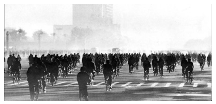
Commuting to work in Beijing in the early 1980s. This will be a common sight under Agenda 2030.

The document actually refers to itself as "the new universal agenda," having 17 "sustainable development goals" and 169 "specific sustainable development targets." Given that its goals and targets extend into or affect every major aspect of human conduct and social behavior, the reader should take seriously the ambition hidden in its title, Transforming the World . Beneath the clinical, pseudo-scientific jargon, political pandering and devious weasel words lurks a blueprint for world government, where the ruling global elite will manage the human herd in accordance with their Marxist ideology.