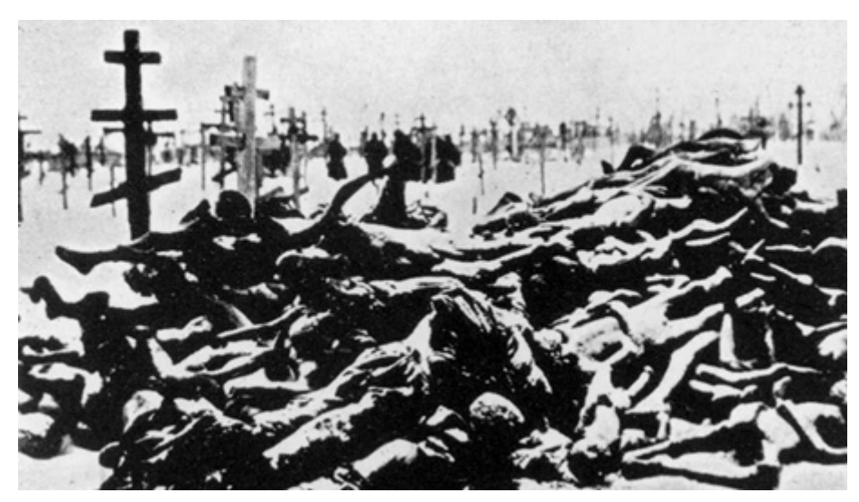
Holodomor, Ukraine, 1932-33

As many dictators have shown in the past, and historians have warned, the easiest way to control – and destroy – a nation is to control its food supply. Stalin murdered between 5 and 10 million men, women and children in the Ukraine in 1932-33 by simply requisitioning the national grain harvest and food supply. An entire nation can be brought to its knees in just ten days by such means. The Ukrainians called it Holodomor, extermination by hunger, "to kill by starvation".