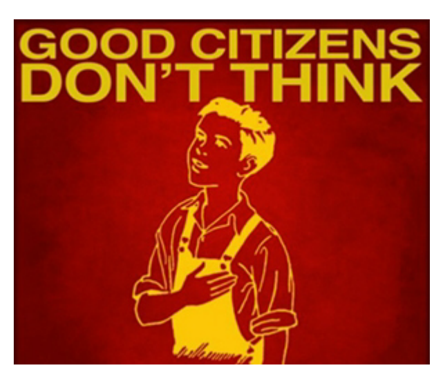
Are you a good citizen?

In this instance, the ever-elastic term "sustainable development" will facilitate Globalist control of "institutions at all levels." Peace will be maintained by the early detection of dissenting voices; co-operation will be achieved through coercion; and unquestioning obedience will be rewarded ("justice for all"). The unstated corollary, of course, is that non-compliance by the non-inclusive few will be 'rewarded' by compulsory transfer to a more appropriate "human settlement", such as a prison or a work camp.