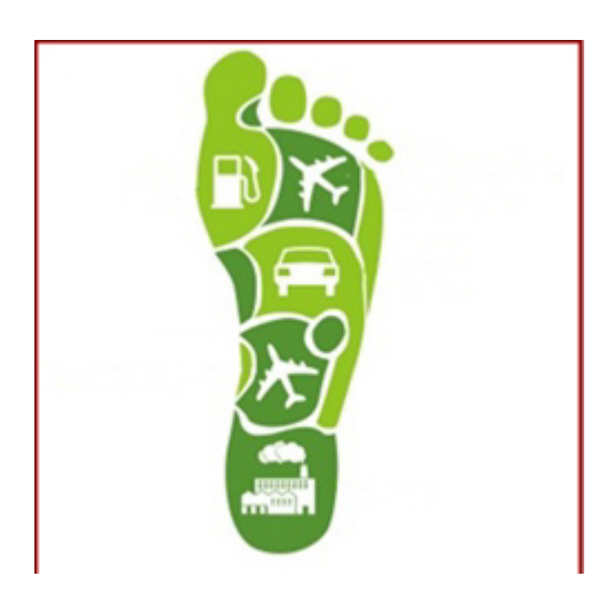
The so-called 'carbon footprint' which has been devised by the Globalists to control all human behavior at an individual, communal and national level by controlling all energy usage.

The global 'energy' authority will decide how much energy the individual is entitled to use over a given period, such as so-many gallons of gasoline a year, or whether a person is even allowed to own a vehicle powered by gasoline. The so-called carbon footprint, with its built-in energy allowance, will impose severe restrictions on what a community or a business can do. Furthermore, the energy will have to be 'modern' or renewable (as the goal explicitly states). This means that all energy uses will have to conform with the regulations specified by the global authority, with financial and other penalties for anyone trying to operate beyond the terms of their license (All energy usage will require state approval). Just as families will be constrained by a one-child policy, they will also be restricted by a one-car policy (with engine size and annual mileage specified), and confined to a small, energy efficient apartment with only so many square feet per person.