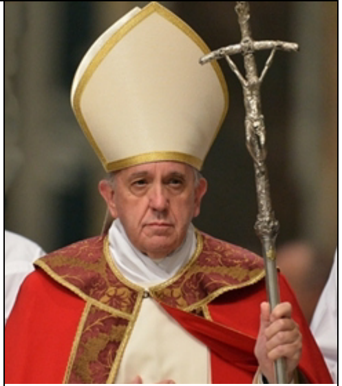
Pope Francis carrying the blasphemous 'broken cross'

The citizens of North America and Western Europe are largely unaware that their countries are controlled by governments that are fundamentally Marxist. While their leaders are careful not to use the language of Marxism, and their programs and manifestos are expressed in fairly neutral language – with no hint of their long-term intentions – the bankers and industrialists who 'own' the politicians are working to bring all nations together under a unified system of global governance.