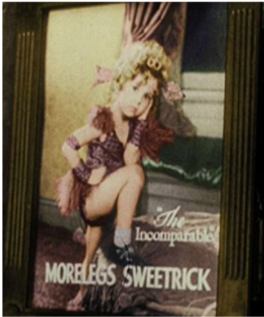
Publicity poster for 'Kid in Hollywood' (1933)