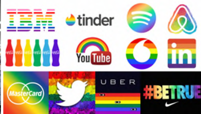
Co-ordinated corporate support for LGBTQ.

Some readers may have difficulty believing that natural sexuality is being undermined in this way, where major corporate players and industrial conglomerates are conspiring to impose the LGBTQ ideology on society as a whole. But it is happening right before our eyes! The draft Equality Act, which is currently before the U.S. Congress, will criminalize anyone who dares to defend the Christian position on sexual relations or to say anything that might ‘offend’ militant sodomites. The Bill was introduced on March 13, 2019, and passed by the House of Representatives on May 17.