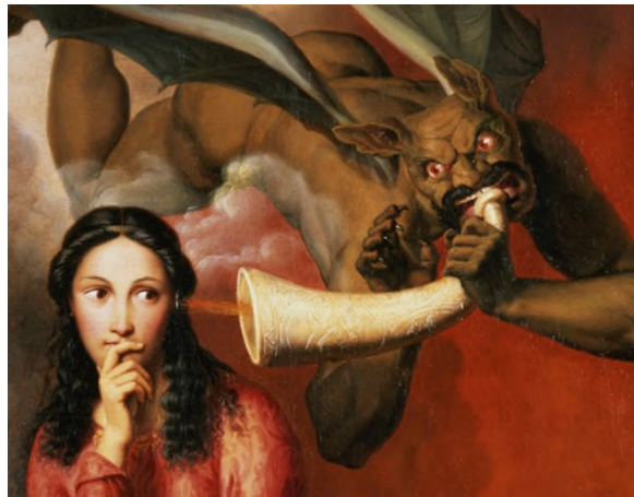
Devil Tempting a Young Woman, 1832

The following story came from a person whose testimony I trust. When he was aged fifteen his family moved to a new home. The next-door neighbors were newly married and had one child, aged about 3 months. Since they too were new to the area and knew no-one who could babysit their infant daughter for a few hours, they asked the boy’s mother if he could help out. She agreed and he duly went along and sat in their living room while the child slept in the next room. Then something happened that shook him to his core.