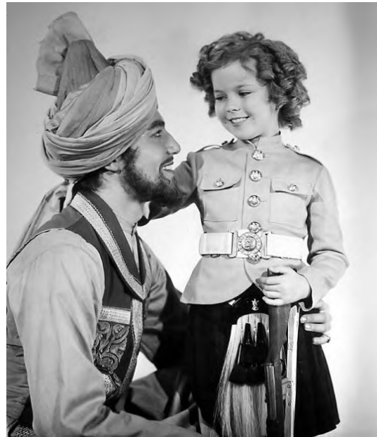
Publicity still for 'Wee Willie Winkie' (1937)

It is doubtful whether, even today, a mainstream movie review would broach the subject as boldly as Greene did.