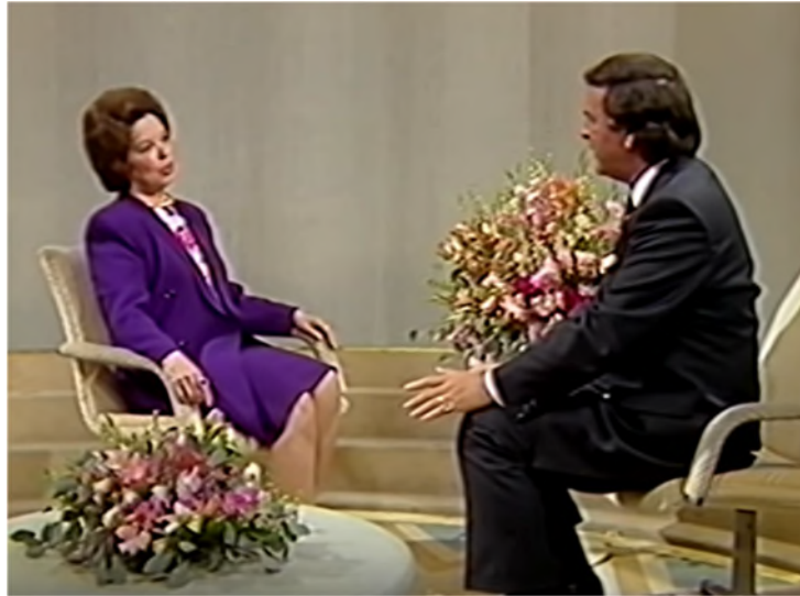
Interview with Wogan, 1989