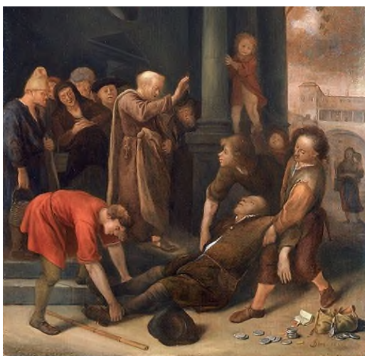
The Death of Ananias by Jan Steen (1651)

Satan hates this. He wants to be the one who controls our breath, our spirit, our life. He wants to place his hand, as it were, over our mouth and nostrils and determine how much “breath” we receive. He wants to take the place of God, to be the god “...in whose hand thy breath is” (Daniel 5:23).