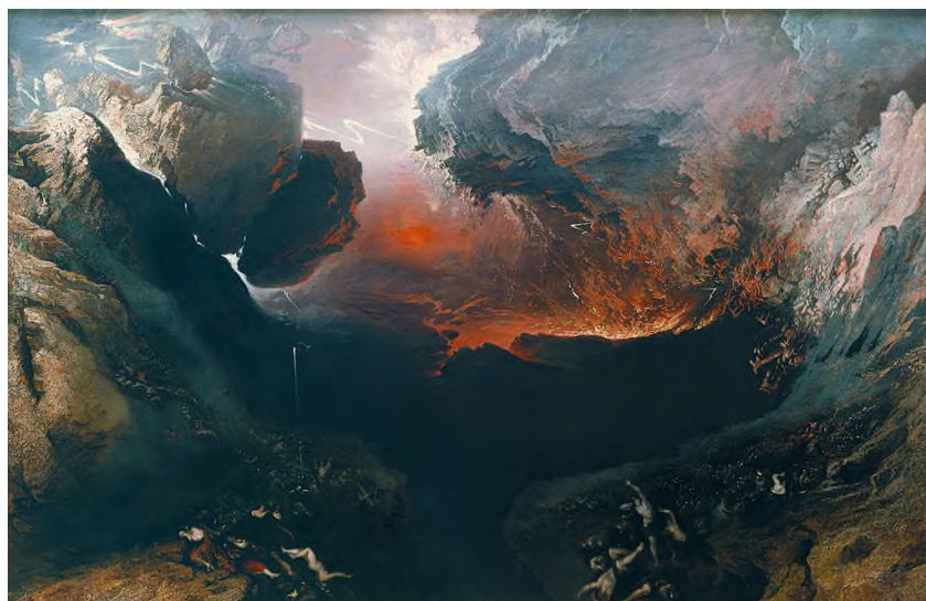
The Great Day of His Wrath by John Martin (c.1851)

“Not forsaking the assembling of ourselves together, as the manner of some is; but exhorting one another: and so much the more, as ye see the day approaching” (Hebrews 10:25)