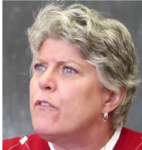
Julia Brownley (D) 1952-