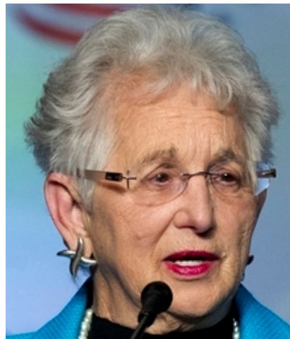
Virginia Foxx (R) 1943-