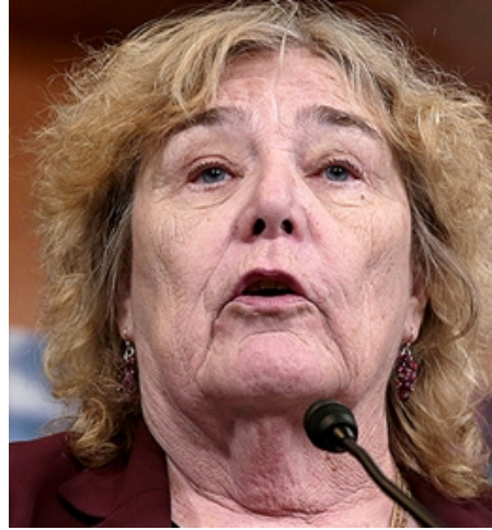
Zoe Lofgren (D) 1947-