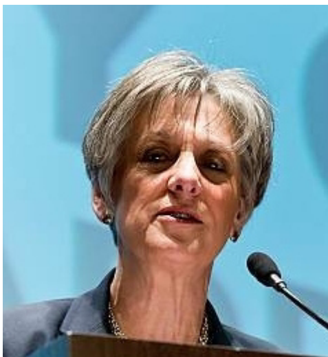
Allyson Schwartz (D) 1948-