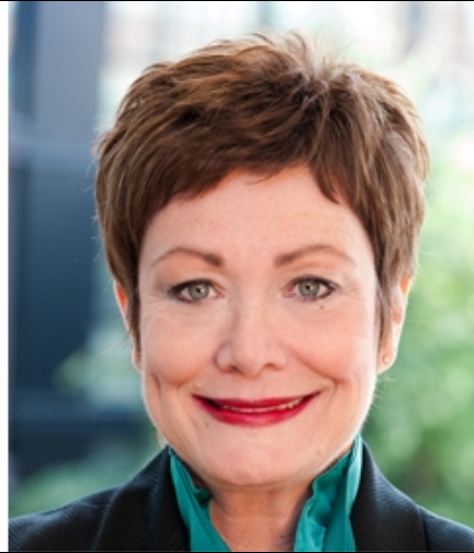
Ellen Tauscher (D) 1951-