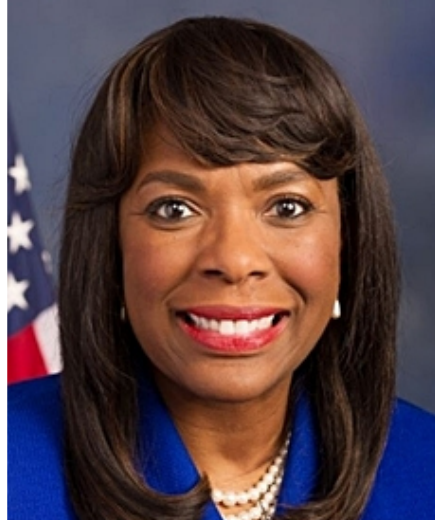
Terri Sewell (D) 1965-