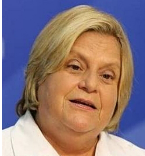
Ileana Ros-Lehtinen (R) 1952-