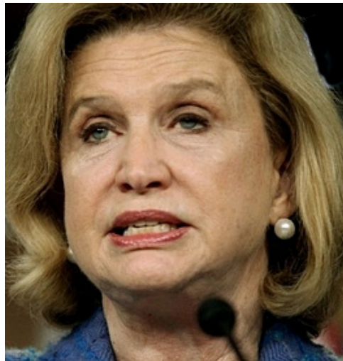
Carolyn Maloney (D) 1946-