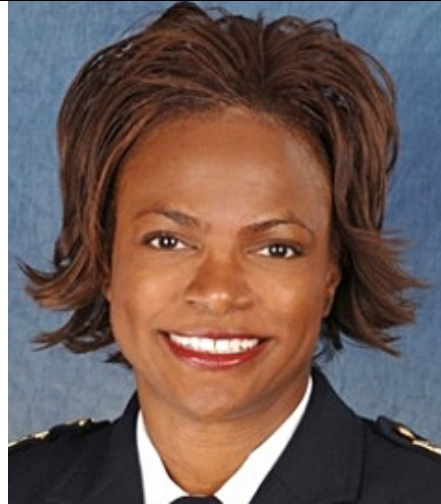
Val Demmings (D) 1957-