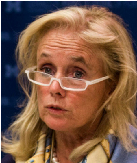
Debbie Dingell (D) 1953-