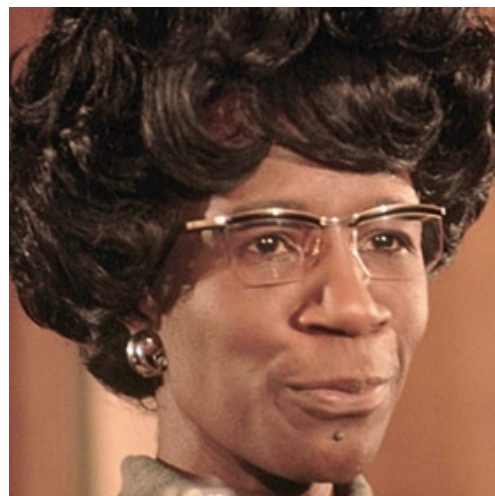
Shirley Chisholm (D) 1924-2005