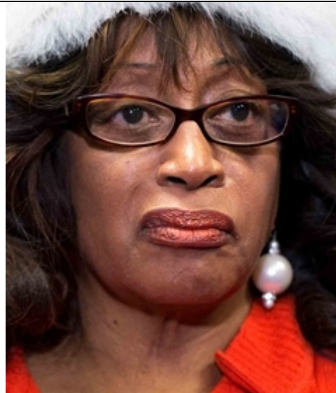
Corrine Brown (D) 1946-