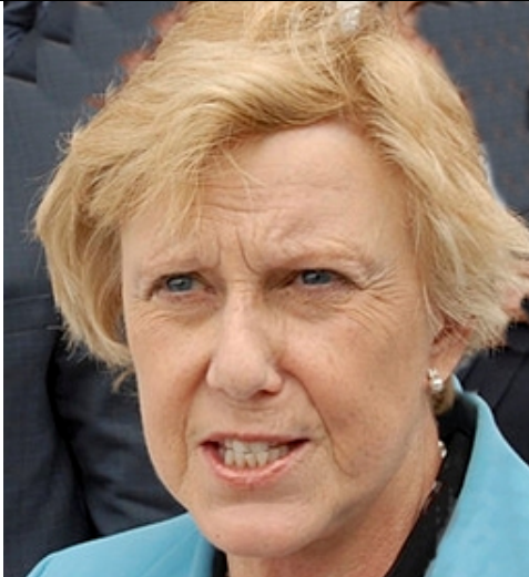
Ginny Brown-Waite (R) 1943-