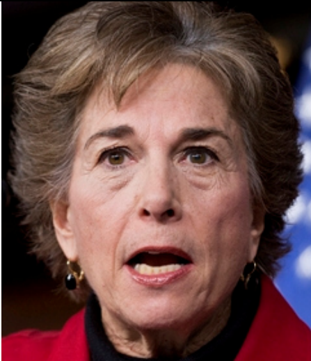
Jan Schakowsky (D) 1944-