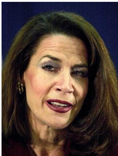
Katherine Harris (R) 1957-