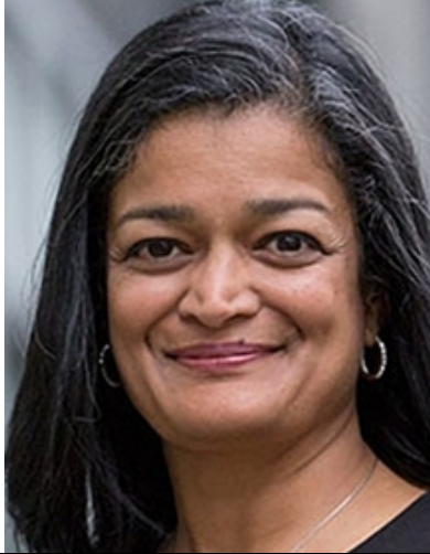
Pramila Jayapal (D) 1965-