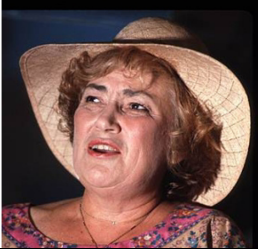
Bella Abzug (D) 1920-1998