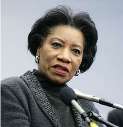
Juanita Millender-McDonald (D) 1938-2007