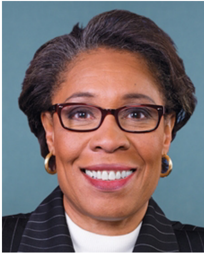
Marcia Fudge (D) 1952-