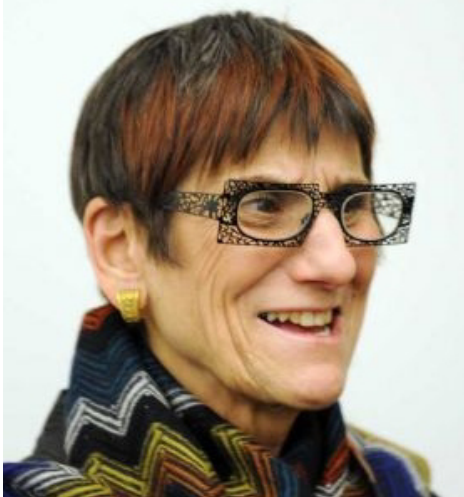
Rosa DeLauro (D) 1943-