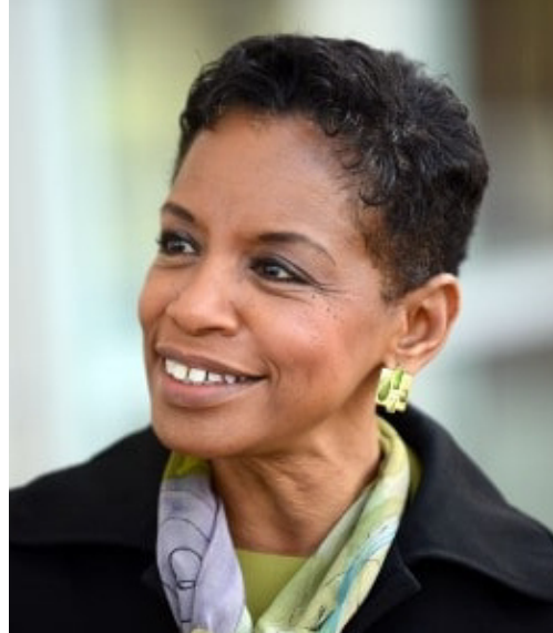
Donna Edwards (D) 1958-