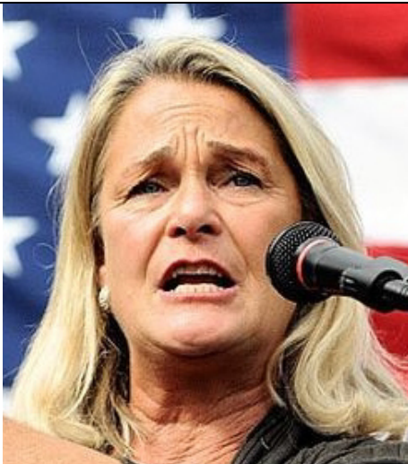
Ann Marie Buerkle (R) 1951-