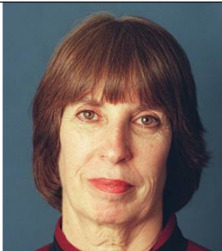
Bobbi Fiedler (R) 1937-