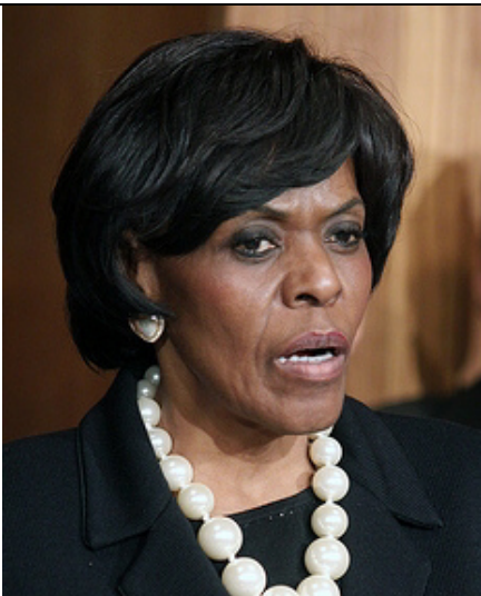
Carolyn Cheeks-Kilpatrick (D) 1945-