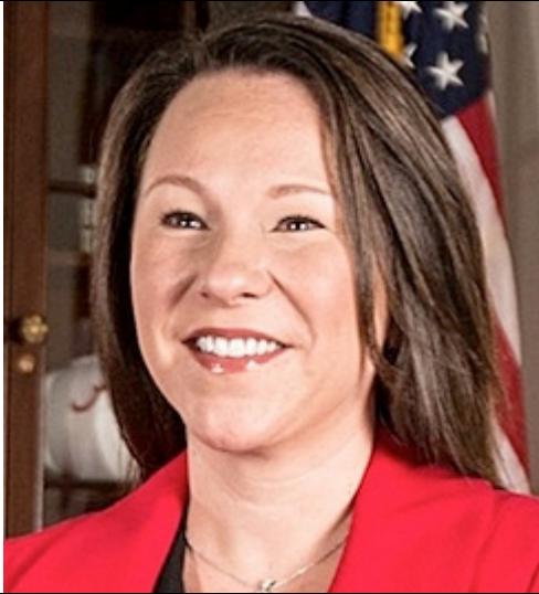
Martha Roby (D) 1955-