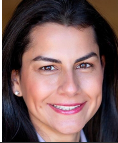
Nanette Barragán (D) 1976-