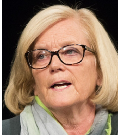
Chellie Pingree (D) 1955-