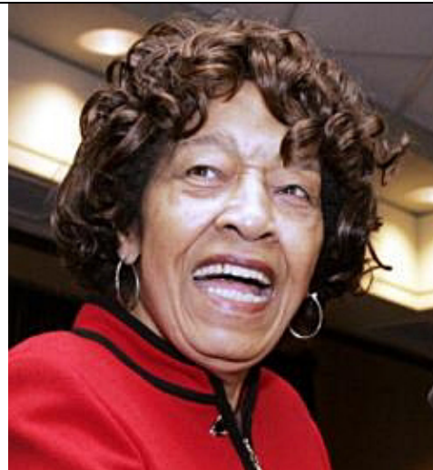
Julia Carson (D) 1938-2007