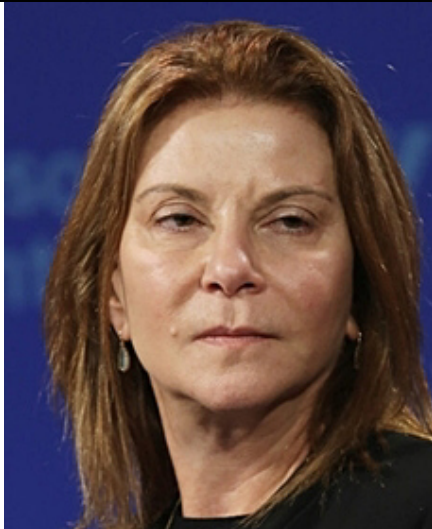
Susan Molinari (R) 1958-