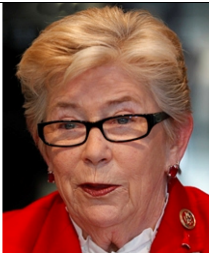
Carolyn McCarthy (D) 1944-