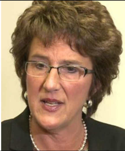
Jackie Walorski (R) 1963-