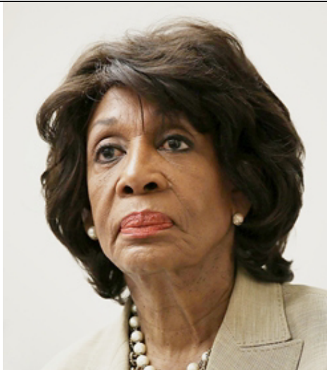
Maxine Waters (D) 1938-