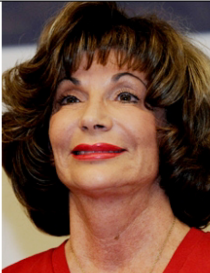
Shelley Berkley (D) 1951-