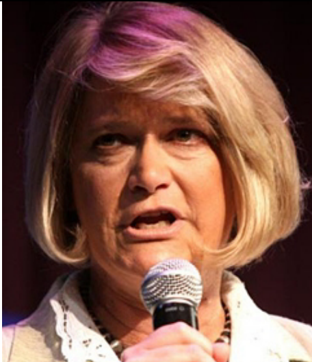
Cynthia Lummis (R) 1954-