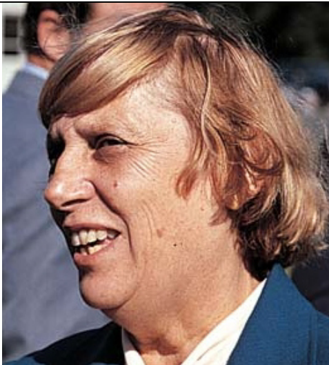
Ella Grasso (D) 1919-1981