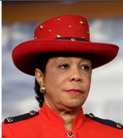
Frederica Wilson (D) 1942-