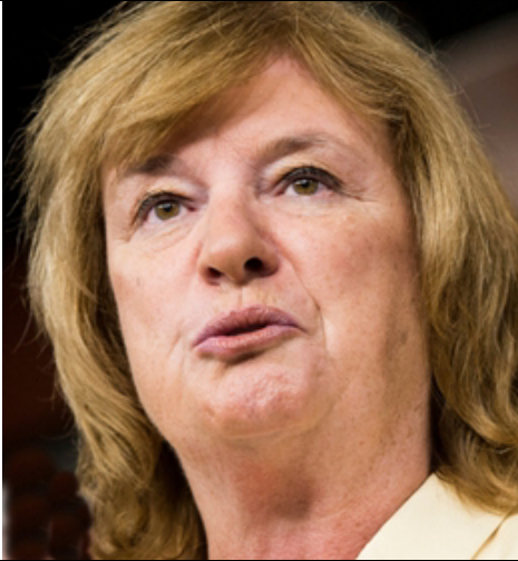
Carol Shea-Porter (D) 1952-