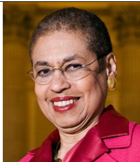
Eleanor Holmes-Norton (D) 1937-