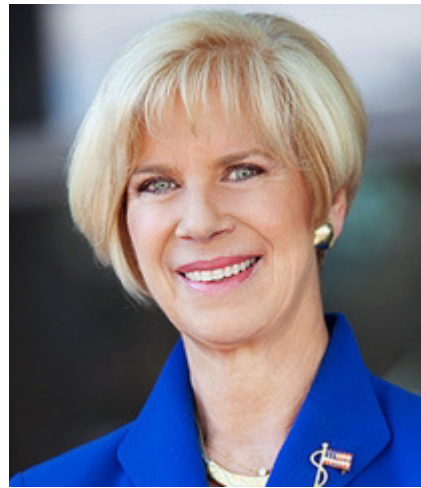
Janice Hahn (D) 1952-