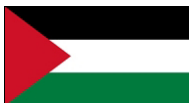
Flag of 'Palestine'