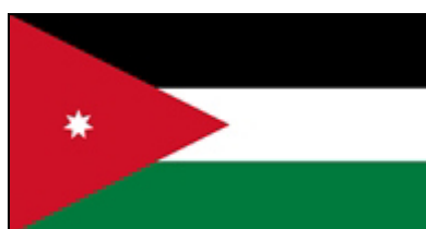
Flag of Jordan

Yasser Arafat was the chief architect of the 'Palestinian' deception, but he made the mistake of choosing a flag for his fictional ethnic group that was virtually identical to that of Jordan, the real home of the so-called Palestinian Arabs: