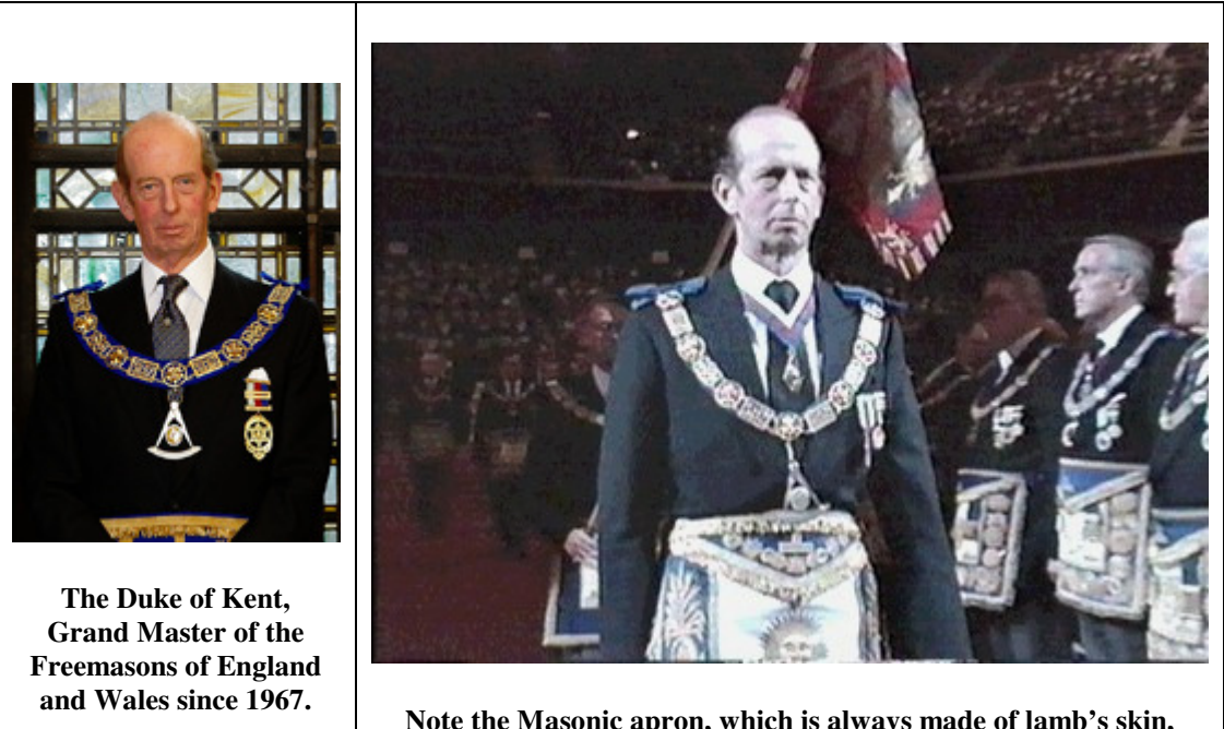
Note the Masonic apron, which is always made of lamb's skin, a blasphemous parody of the Lamb (Christ).

Taken together these principles are proclaiming that the Bible is wrong when it makes an absolute distinction between believers and unbelievers, between those who are saved and those who are lost. Freemasonry and the New Age movement completely reject original sin, the fallen state of man, and the need for redemption through the saving blood of Christ. In their view, man is not lost but continually evolving through experience into a higher spiritual state.