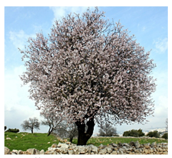
Almond tree near Jerusalem

Since the almond is the first tree to bloom after the winter period, it is used to illustrate expediency. As the LORD said to the prophet, "I will hasten my word to perform it."