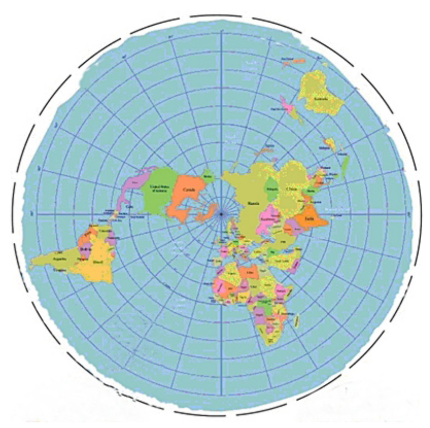
The disc of the earth, as God made it. The outer rim is the Antarctic.

The main textual arguments for the theory are set out in Appendix A. They depend on an awkward application, akin to a reinvention, of four standard Hebrew words. It strains credulity that a major reinterpretation of the Bible should have been accepted by scholars of any tradition on the basis of such feeble evidence.