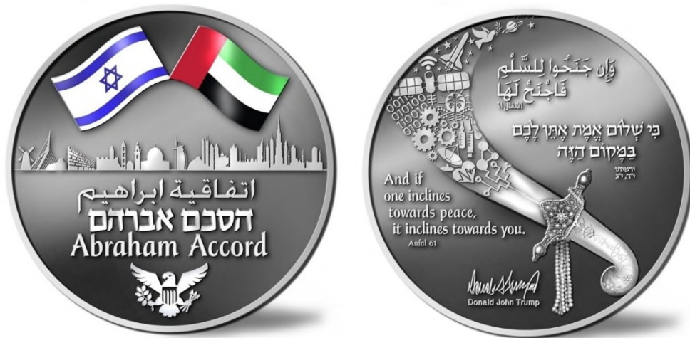
Medal commemorating the Abraham Accord signed by the US, Israel, and the United Arab Emirates in August 2020.

Plainly, the masterminds behind New World Order are planning to create a One World Religion comprising members of the 'Abrahamic faith'. The proposed new Temple on the Temple Mount will probably be presented to Muslims as a 'House of Prayer' that will be pleasing to Allah.