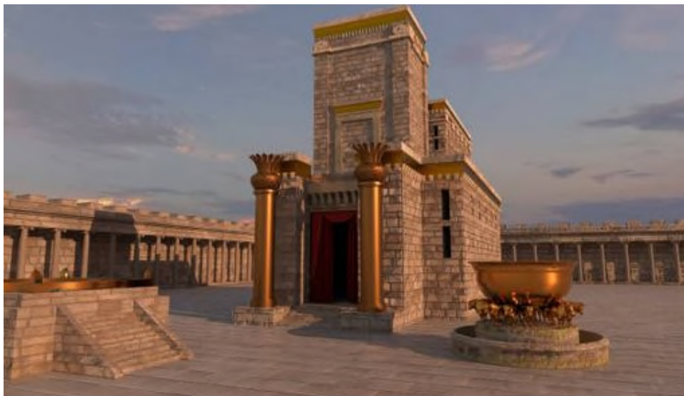
Artist representation of Solomon's Temple.

A plausible sign of this “strong delusion” will be the importance attached by nominal Christians to the construction of the Third Temple in Jerusalem. Many who will end up receiving the mark of the beast will believe that the Third Temple had been constructed by well-intentioned men to honor the LORD God of the Bible. In reality it will be constructed by Freemasons and apostate, Cabalistic Jews to honor the Antichrist, the false messiah.