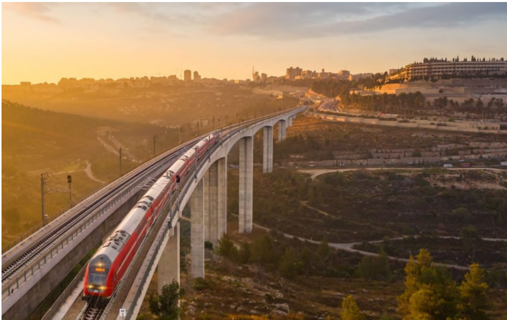
Current rapid rail link between Tel Aviv and Jerusalem, introduced in 2019.

Last week the Airports Authority for Israel announced that a new, ultra-modern terminal would open at the airport in 2023. This is intended to cater for the anticipated increase in international visitors coming to Jerusalem. The proposed high-speed line, linking the airport to the Western Wall, will operate from this terminal (Estimated travel time: 28 minutes).