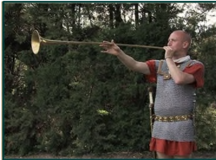
The ‘tuba’ or trumpet used by the Roman military to issue orders to their troops. It could be heard distinctly over a wide area.

Metaphors and images derived from the ubiquitous presence of the Roman armies crop up frequently in Paul’s writings. Perhaps the best known is “ the whole armour of God ” in his letter to the Ephesians. He also refers to disciplines associated with the Greco-Roman games, where athletes competed with one another for the prize or laurel wreath, the stephanos or crown which he exhorts all believers to keep continually before them.