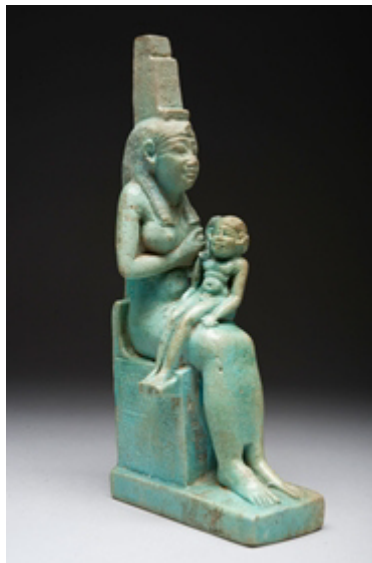
Isis suckling Horus

Note that Mackey reassures the reader that it is possible to venerate the generative power of the phallus "without the slightest reference to any impure or lascivious application." As Masons advance into the higher degrees this form of worship receives even greater emphasis.