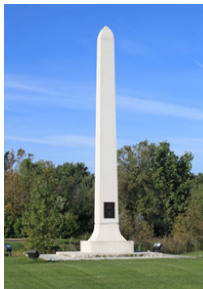
Avis Obelisk Pittsfield Township, Michigan

"...the wicked shall do wickedly..." - Daniel 12:10