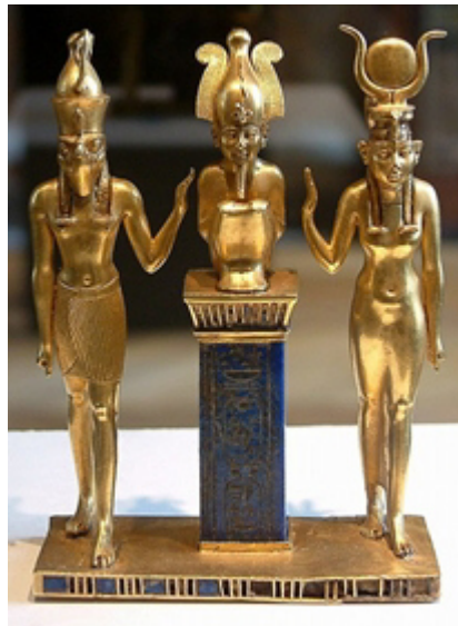
Horus, Osiris and Isis [c.850 BC] Statue at the Louvre in Paris.